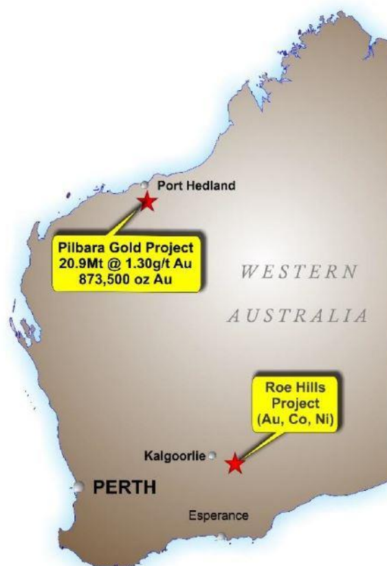
Figure 1: Location of the Roe Hills Project, WA.