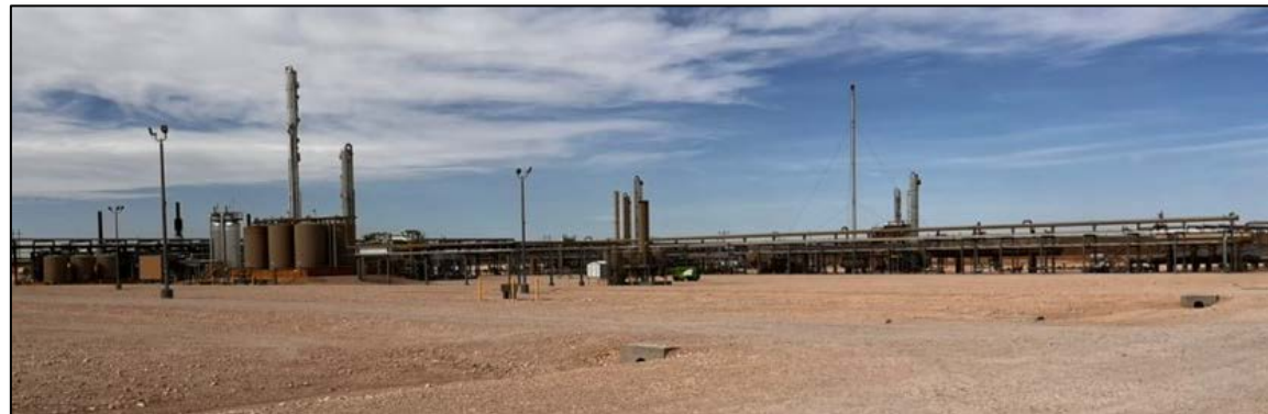
Pronto Midstream's Marlan Natural Gas Processing Plant