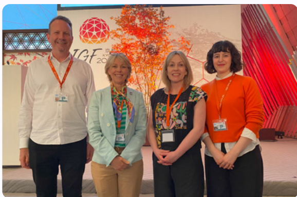
auDA delegation attends the global Internet Governance Forum