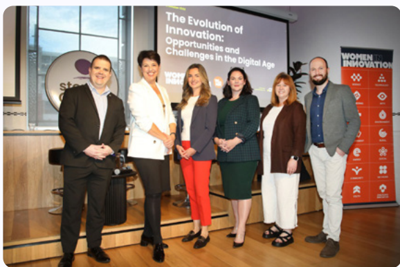
auDA and industry experts at a .au member event in Adelaide