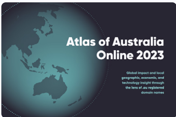
Atlas of Australia Online 2023 research report

of the Rules by providing clarification and minor updates to processes. We thank those who participated in the consultation. The outcome of the consultation and updated Rules are now available on the auDA website.