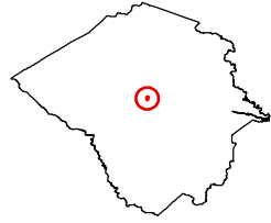
Pitt County, NC

Note: Maps produced by the STB's Office of Environmental Analysis are based on information provided by the applicant and are for reference purposes only.