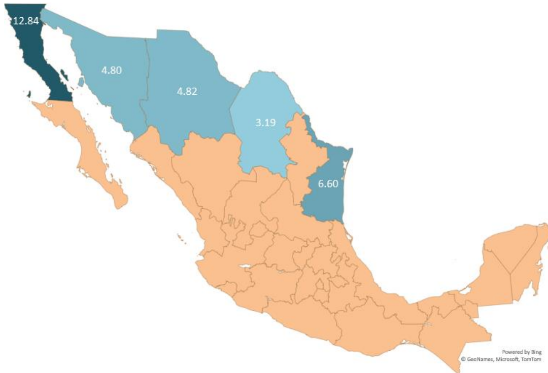
Map 3. International Visitors Entering by Land Ports of Entry (in millions, 2022)

The state of Baja California is the main entry for foreign tourists by land, according to INEGI, with 12.84 million visitors reported in 2022, almost 40 percent of the total visitors registered at the U.S.-Mexico border crossings. The numbers for 2023, available only through half the year, show the same proportion, with a slight increase in total visitors, a reflection of how tourism is still recovering to pre-COVID levels. In 2018 and 2019, the state welcomed an average of 23 million visitors per year.