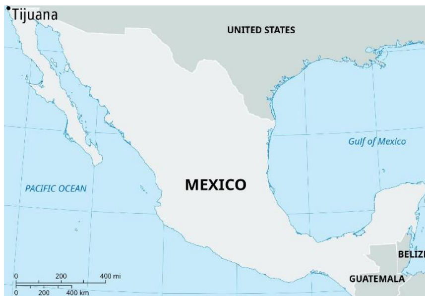
Map 1. Tijuana location on the Mexican territory

Tijuana developed thanks to cross-border trade and became a tourist attraction for day-tripping Californians in the early 1900s. Legal drinking, casinos, racetracks, and an extravagant nightlife further increased foreign visitors, primarily during the U.S. Prohibition in the 1920s (unverified claims of Al Capone himself being sighted while visiting and "investing" in the area are quite common). The city became a spring-break favorite for U.S. students in the second half of the 20 th century. The Mexican government's border industrialization strategy that began in the 1960s diversified Tijuana's economy and attracted foreign capital. The maquiladora program first, followed by globalization, continental free trade, and the current nearshoring trend, have dramatically changed the region's economy over the last 50 years.