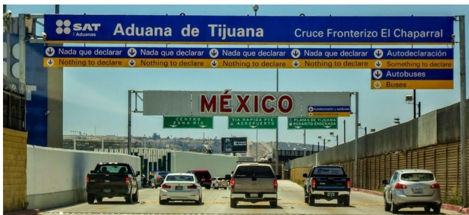
The Tijuana-San Ysidro Port of Entry, seen from the United States

In 2023, companies registered in the Tijuana metro area purchased $1.42 billion of food, agricultural and forestry products from outside of Mexico, with $1.13 billion (80 percent) coming from the United States. The rest came from China, Canada, Chile, and the European Union. The main categories were wood products, pork meat, cheese, poultry products, beef, bakery goods, and food preparations 1 . In terms of the area’s importance as a channel for U.S. exports, Mexico reports