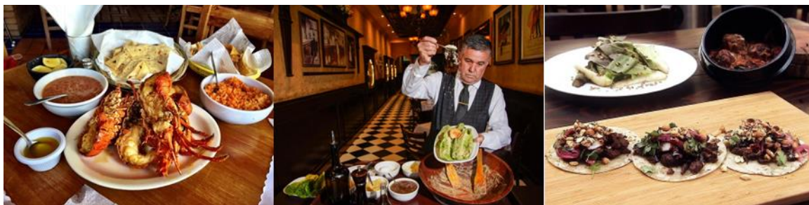
Puerto Nuevo-style lobster, the original Caesar salad, and a sampler of Baja Med recipes.

As for the restaurant industry, Tijuana largely benefits from the geographical advantage of sharing the border with the San Diego metro area, allowing for many same-day/in-and-out visitors that enjoy the gastronomical variety of the city. This has spurred a very peculiar culinary landscape, ranging from food-trucks and gastroparks, to high-end restaurants. Tijuana features four restaurants on the renowned Michelin Guide : Carmelita Molino & Cocina (Bib Gourmand), Tacos El Franc , Mision 19 , and Oryx ; meanwhile Tecate has one, Restaurante Amores (2024 Service Award winners).