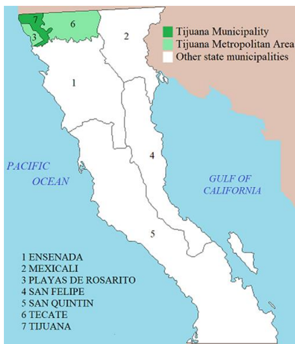
Map 2. Tijuana Municipality and Metropolitan Area

Perhaps not well known is that, with over 1.92 million inhabitants, Tijuana is technically the country’s most populous local (i.e., third tier) political subdivision. In Mexico, however, it is more common to rank cities using the concept of metropolitan areas, which might include other municipalities or unincorporated suburban areas. In this case, Tijuana’s metro area includes two neighboring municipalities: Tecate and Rosarito (official name: Playas de Rosarito), which are scarcely inhabited, so the overall population only increases to almost 2.16 million inhabitants.