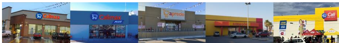
The five different store formats of regional supermarket chain, Calimax.

Like many other metropolitan areas in Mexico, there are several supermarket chains in Tijuana. Founded in 1939 as a grocery store, Calimax is the retail sector's main reference in the area. After adapting to the multi supermarket format in 1968, it expanded throughout Baja California and into neighboring Sonora. It also developed a diverse configuration of stores: supermarket ( Calimax and Calimax Plus ), discount store ( Aprecio ), wholesale ( Bodegon ), and convenience store ( Cali Super Xpress ). Almost three quarters of its 100 stores are in the Tijuana metro area. The company also has a joint venture to run the Mexican stores of Smart & Final , and with a massive, state-of-the-art distribution center in Tijuana, Calimax runs its own distribution/logistics network. Between 20-30 percent of its products are imported from the U.S., including some for their locally recognized private labels.