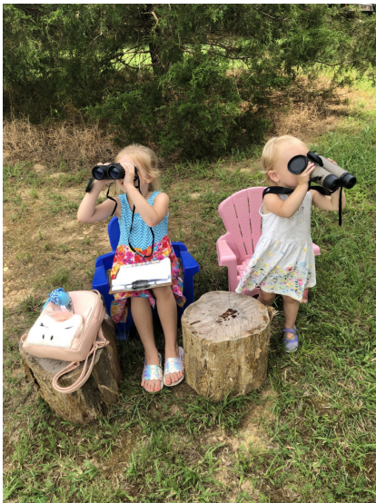
Bird watching