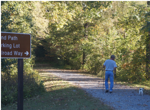
Dog walking

Environmental Education and Recreation Area