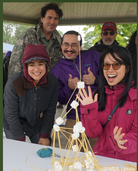
Staff competed for glory during office olympics, including in classic events such as the pencil toss, barred owl and spotted owl identification, invasive species archery, marshmallow-spaghetti structure construction, and more.

recognized accomplishments. Staff also discussed building a "team of teams," to build bridges with colleagues they may not normally interact with and to enhance connections statewide.