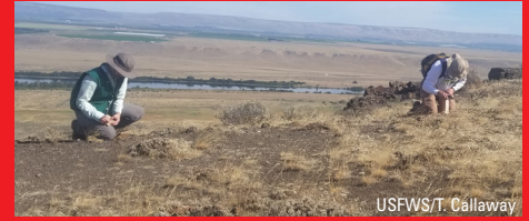
Previous seed collection for the threatened Umtanum desert buckwheat