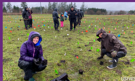
Members of the PSSI team planting camas with the Cowlitz Tribe