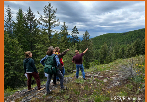
Members of the ICB team with U.S. Forest Service partners during a site visit to Colville National Forest