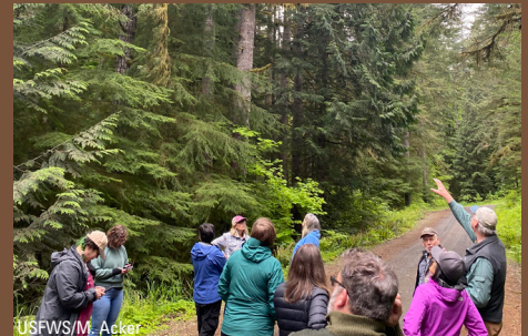
Members of the BIL and Westside Forest teams during a site visit.