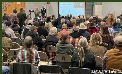
One of the public meetings for the North Cascades grizzly draft EIS and proposed 10(j) rule