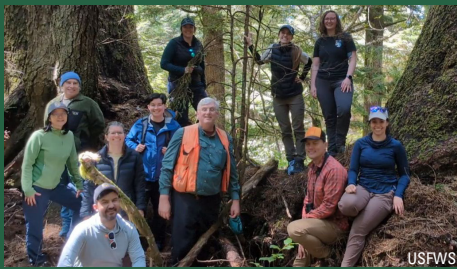
The Westside Forests team in May 2024