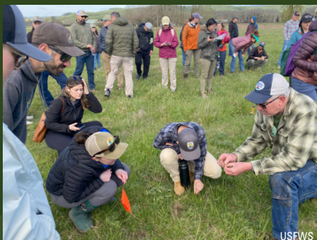
Partners for Fish & Wildlife 101 training in southwest Washington in April

The Coordinators team brings together expertise and skills to support all WA-ES teams and help ensure a consistent approach to state-wide program implementation. The team serves as the centralized point of contact for the USFWS' Regional and Headquarter offices, while also providing program-specific expertise to WA-ES teams and external partners.