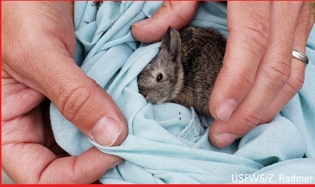
A two-week old Columbia Basin pygmy rabbit, approximately the size of a kiwi fruit

Habitat restoration is a high priority for the Shrub-steppe team. One of the team's biggest goals is to get the right seed, in the right place, at the right time. In FY 24, an interagency team consisting of NPS, BLM, and USFWS secured $556,000 in Bipartisan Infrastructure