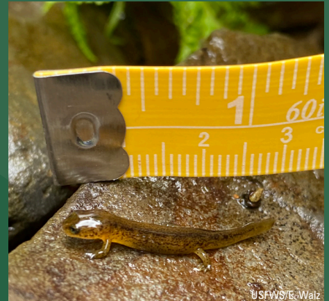
A small Cascade torrent salamander found during a survey