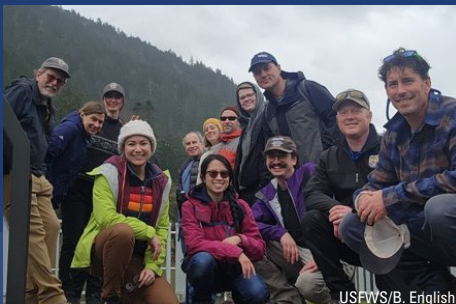
Members of the CLAM team in the field in Olympic National Park