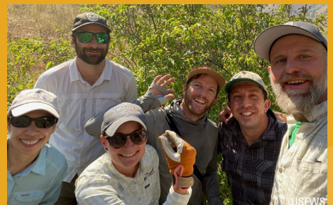
Members of the ESC team in the field

PROJECTS THROUGH THE AQUATIC RESTORATION PROGRAMMATIC OPINION