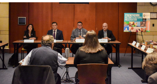
ACHP MEMBERS PARTICIPATE IN A CONGRESSIONAL ROUNDTABLE ON STRENGTHENING HISTORIC PRESERVATION.