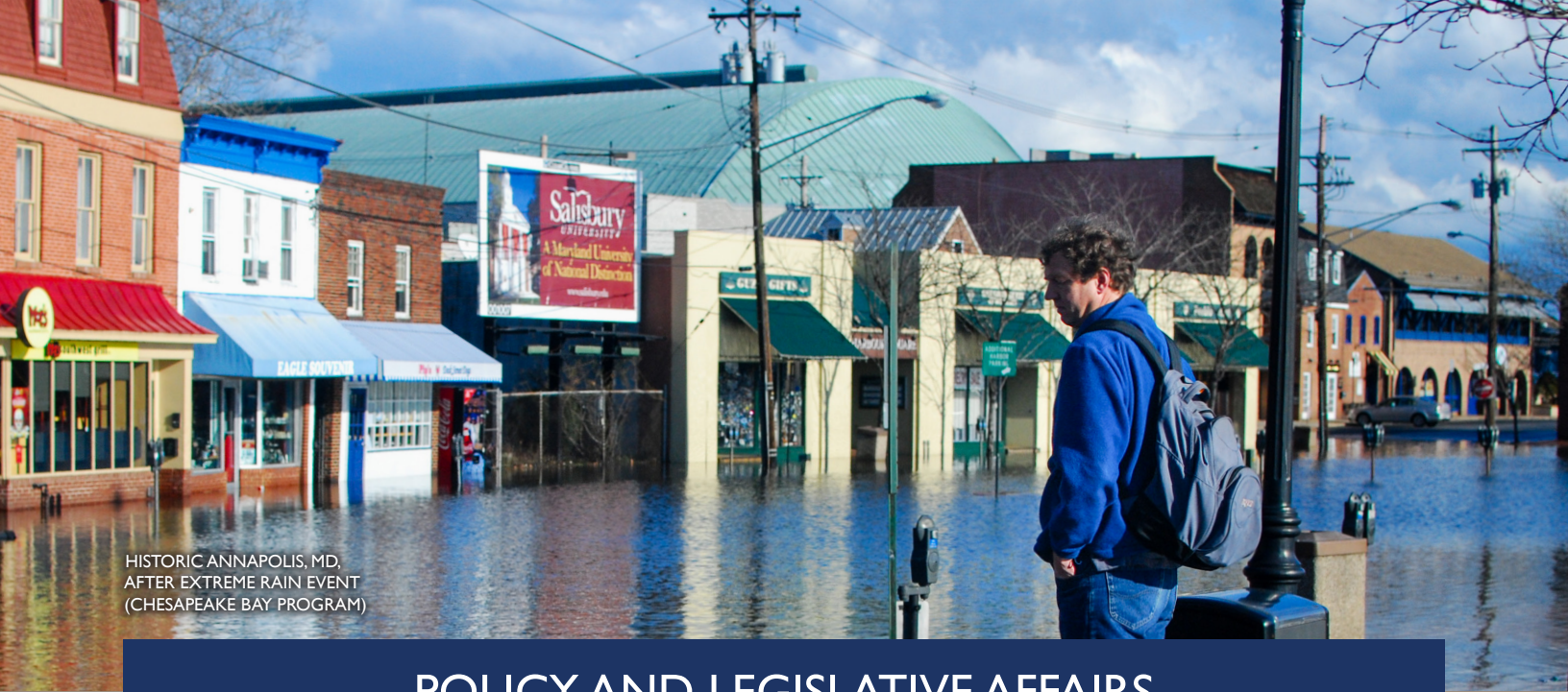
HISTORIC ANNAPOLIS, MD, AFTER EXTREME RAIN EVENT (CHESAPEAKE BAY PROGRAM)