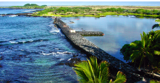
INDIGENOUS KNOWLEDGE SHAPES FISHPOND PRESERVATION AT KALOKO-HONOKŌHAU NATIONAL HISTORICAL PARK, HI. (NATIONAL PARK SERVICE)