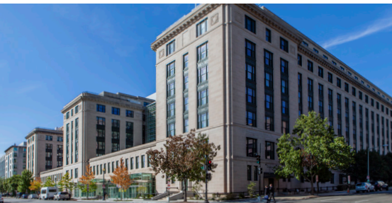
AT THE U.S. GENERAL SERVICES ADMINISTRATION BUILDING IN WASHINGTON, DC, A SEGMENT OF THE GROUND FLOOR IS OUTLEASSED AS PUBLIC RETAIL PAVILIONS.