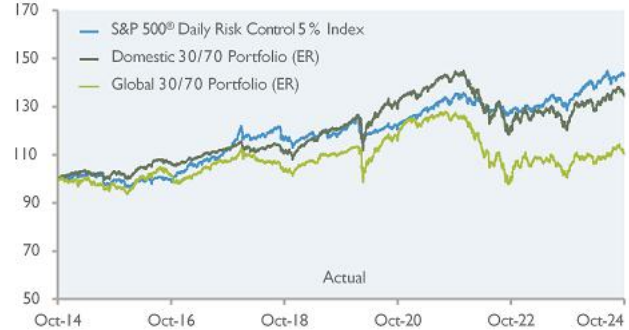
Hypothetical and actual historical performance: Oct 2014 through Oct 2024