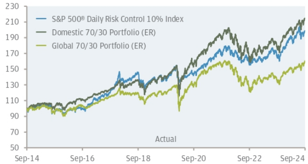
Hypothetical and actual historical performance: Sep 2014 through Sep 2024