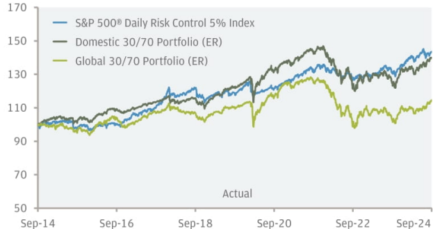
Hypothetical and actual historical performance: Sep 2014 through Sep 2024