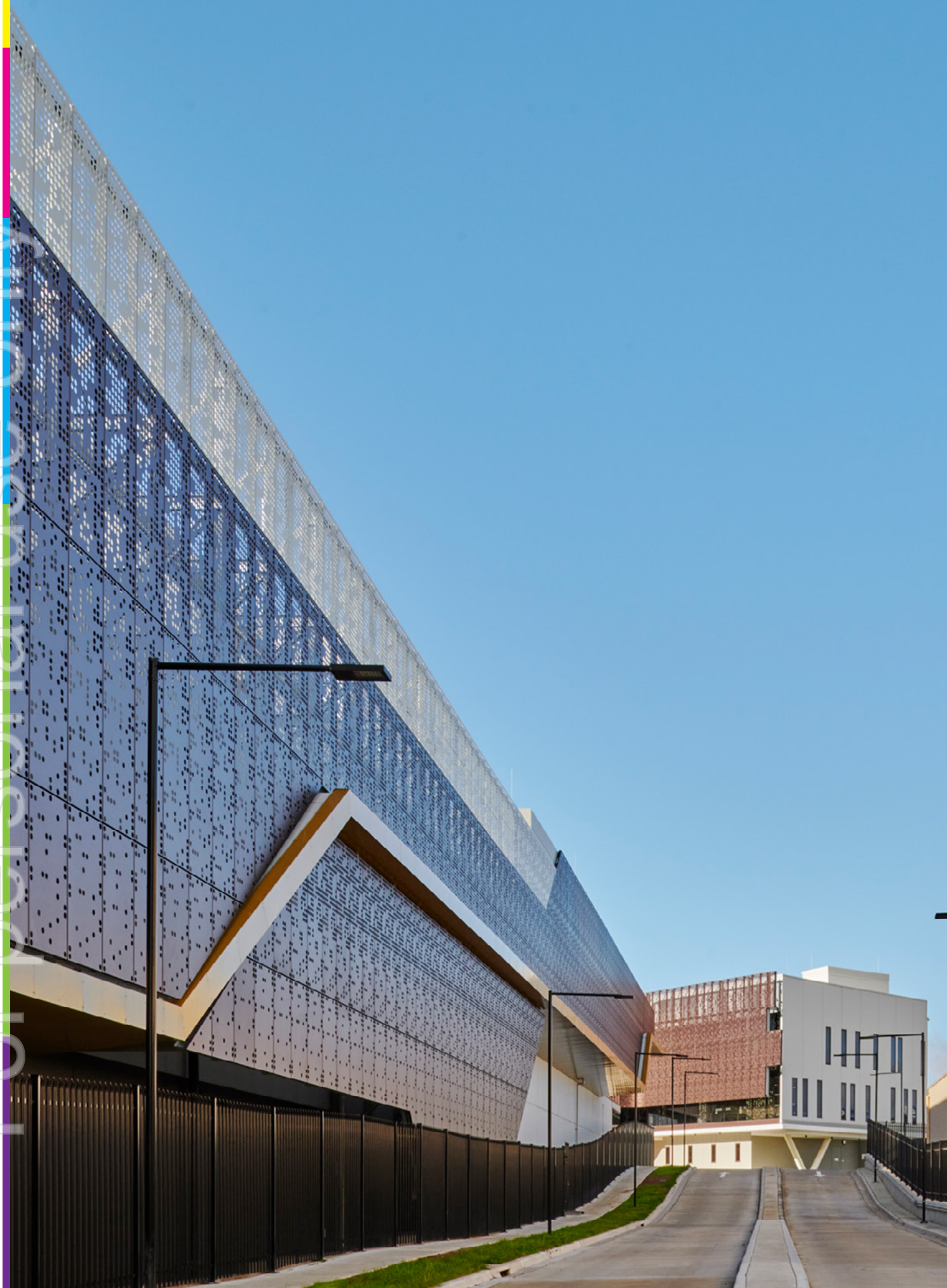
CDC Hume Campus