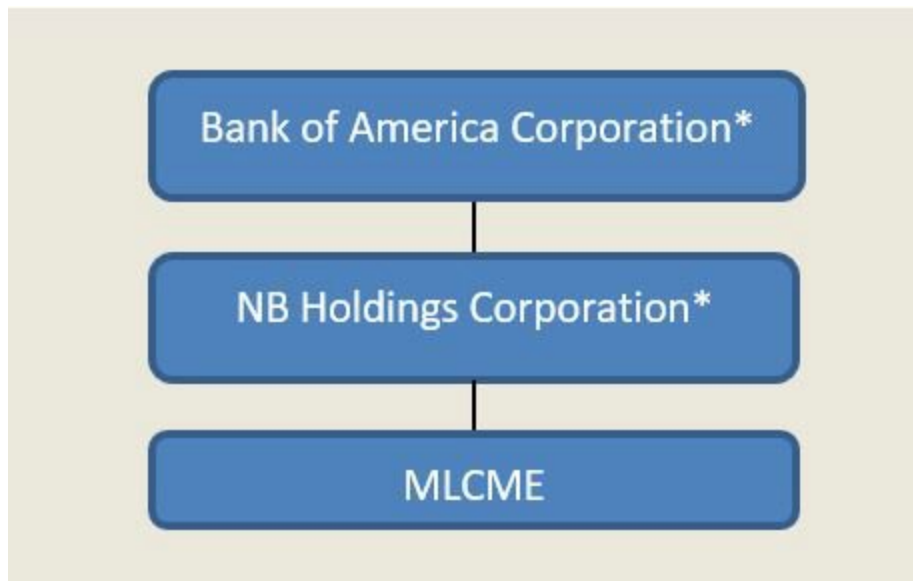
Figure 1.3.F1. – MLCME Ownership Structure

* Not all subsidiaries of Bank of America Corporation and NB Holdings Corporation are represented.