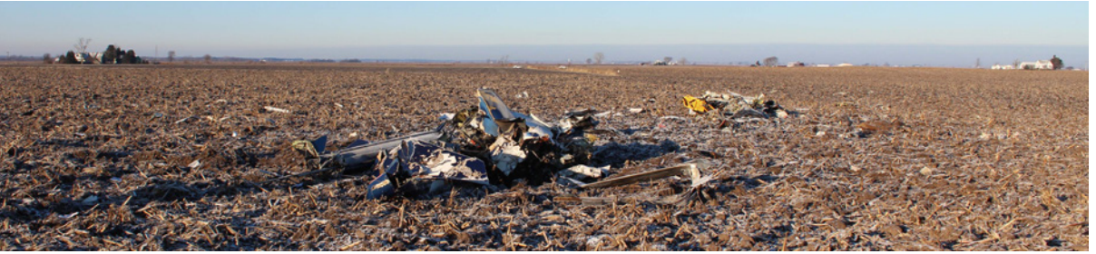
Figure 5. CEN13FA096 accident scene