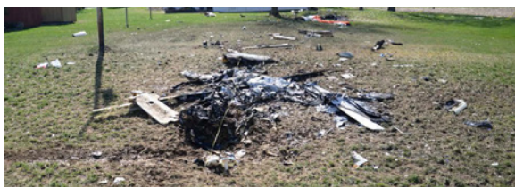
Figure 2. CEN18FA144 accident scene

■ A Cirrus SR22 airplane was destroyed after the pilot reported ice accumulation and subsequently impacted terrain (figure 2). The pilot received a weather briefing the night before the accident and filed a flight plan. Weather information for the time of the accident revealed that the pilot was operating in IMC and icing with light snow, mist, and light rain observed at the surface. At the time of the accident, an active weather advisory was in effect for moderate icing, instrument flight rules/mountain obscuration, and low-level turbulence near the accident site. (CEN18FA144)