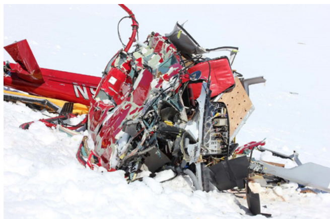
Figure 4. ANC16FA023 accident scene

■ A helicopter on a visual flight rules (VFR) flight returning from a glacier dog camp encountered IMC, snow, icing, and gusting wind and impacted terrain near the departure location (figure 4). On a flight earlier that day, the pilot reported in-flight icing caused by “wet snow;” he decided to continue the mission and evaluate conditions on subsequent flights. The operator did not maintain operational control following the icing report and allowed the pilot to continue flying in the icing conditions despite it being prohibited in the rotorcraft flight manual. (ANC16FA023)