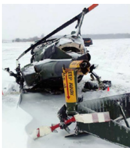
Figure 3. CEN18FA074 accident scene

■ An aerial observation flight impacted terrain after departing in snow, icing, and IMC (figure 3). Satellite, radar, and weather observations near the accident site reported low clouds and visibility with light to moderate snowfall at the time of the accident. Weather models and advisories supported the probability of structural icing in the area at the time of the accident. Despite accessing the NOAA Doppler radar loop weather imagery depicting these conditions before the accident flight, the accident pilot elected to depart in snow, which illustrates his incomplete understanding of the hazard. The NTSB determined that the probable cause was a loss of engine power due to snow or ice ingestion at an altitude that was insufficient to allow for engine re-ignition. (CEN18FA074)