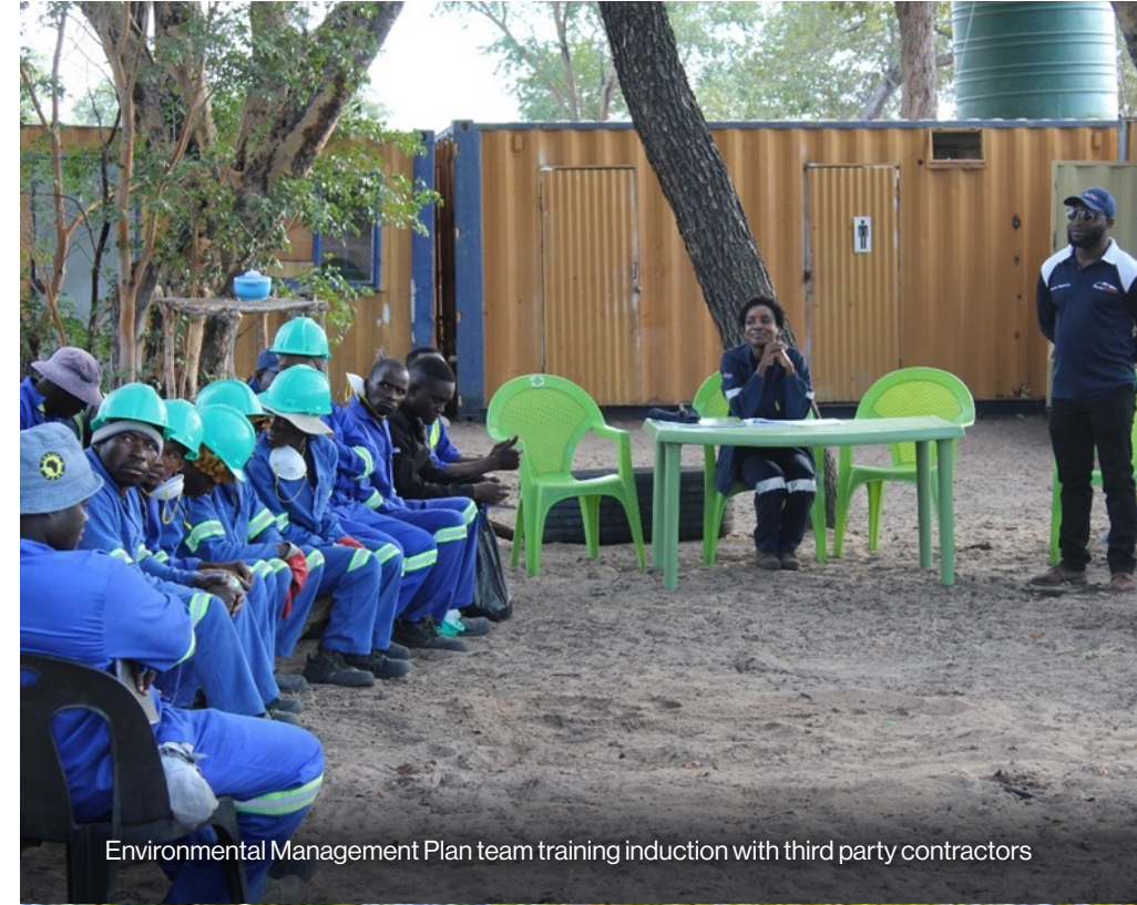
Environmental Management Plan team training induction with third party contractors

Through this report we intend to communicate on these efforts and the way in which we structure our operations to consider the environmental, social, economic, and cultural context in which we work.