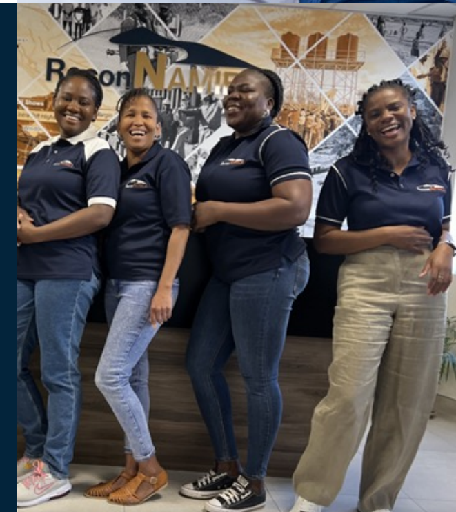
We have a commitment to providing opportunities for groups who are normally under-represented in the workforce.

In Namibia of 253 employees, 57 are female and 196 are male.