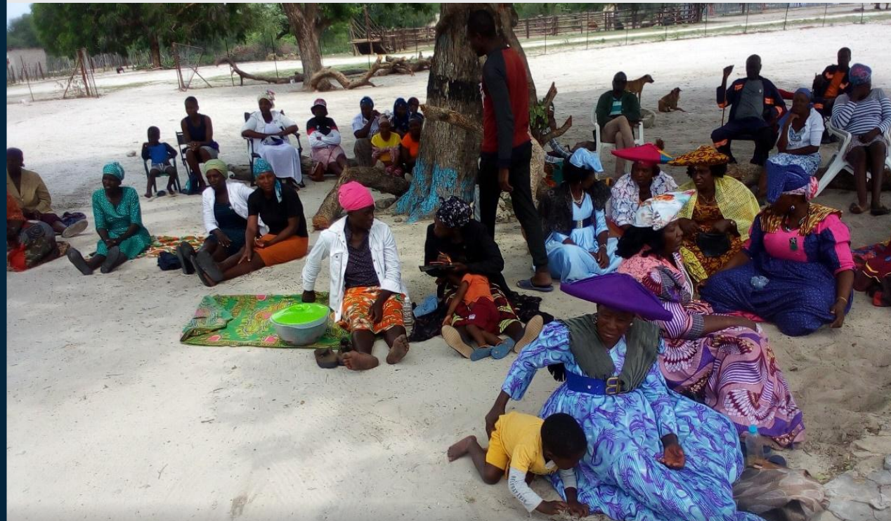
The Botswana Stakeholder Mapping exercise reached many villages and received active participation from many community members

Similar mapping analysis has been completed in Namibia and the team continues to update their analysis as our project progresses.