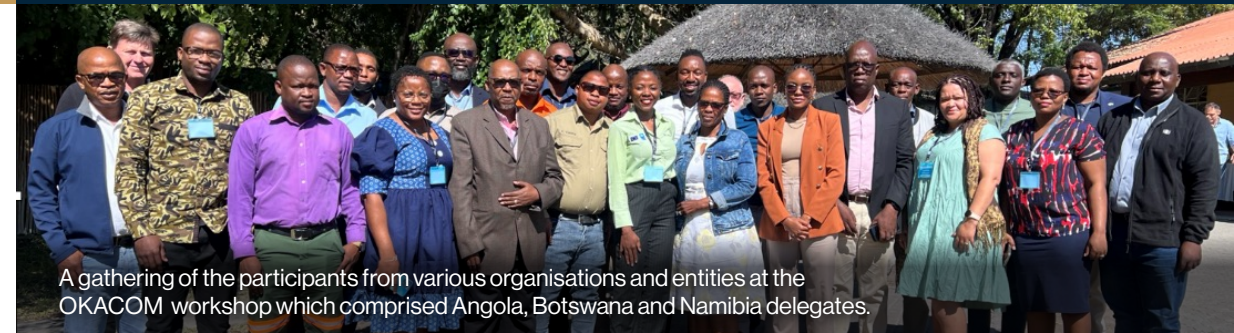
A gathering of the participants from various organisations and entities at the OKACOM workshop which comprised Angola, Botswana and Namibia delegates.

The lands in the Botswana licence area are contiguous with those in the Namibia licence area. Together, the Namibia licenced property and the Botswana licenced property provide ReconAfrica with access to explore the entire Kavango Basin, potentially one of the largest onshore undeveloped hydrocarbon basins in the world.