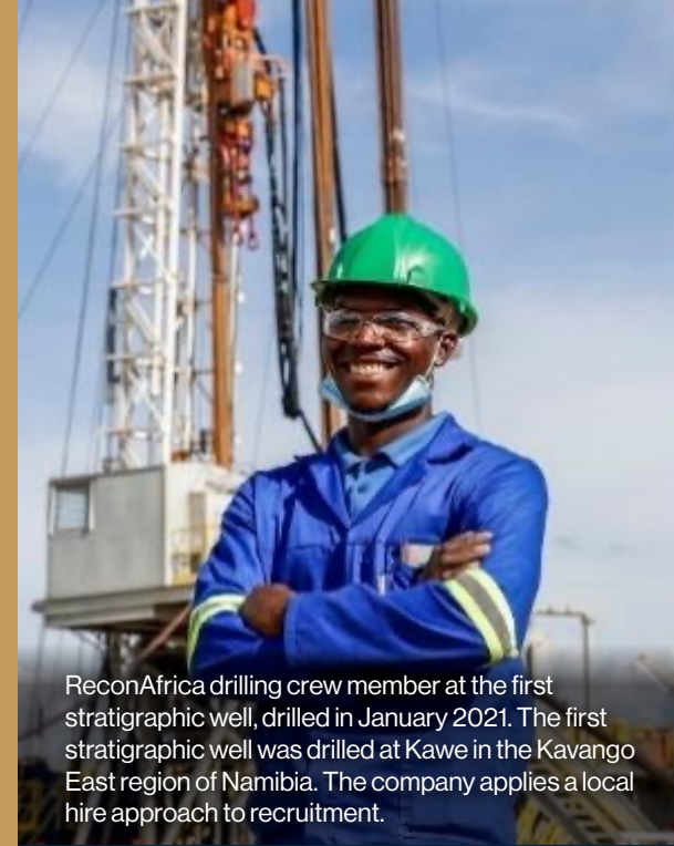
ReconAfrica drilling crew member at the first stratigraphic well, drilled in January 2021. The first stratigraphic well was drilled at Kawe in the Kavango East region of Namibia. The company applies a local hire approach to recruitment.

The information gathered during the two 2D seismic programmes and eFTG surveys, enabled the company to complete data integration and interpretation steps which are integral to the exploration process. These data have been invaluable as the foundation for our next phase of activities including drilling exploration and appraisal wells that will commence in July 2024.