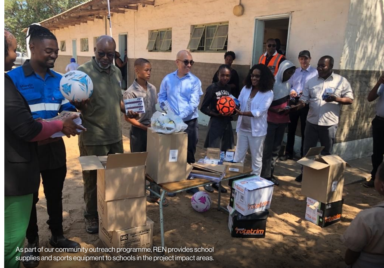
As part of our community outreach programme, REN provides school supplies and sports equipment to schools in the project impact areas.

We value our relationships with governments, communities, employees, suppliers, and other stakeholders. We appreciate the importance of local content and making a difference in energy development and transition where our projects are located. We also implement projects that have a socio-economic-focus.