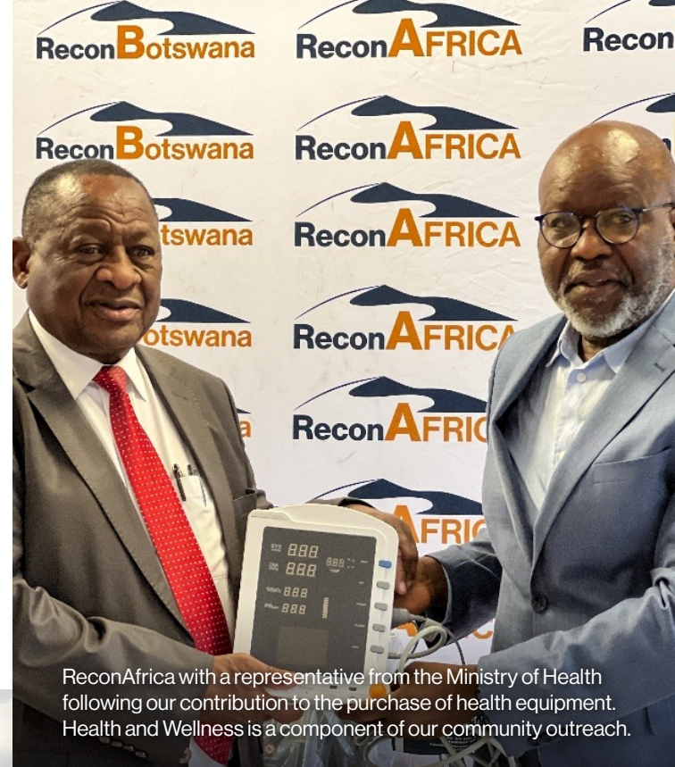
ReconAfrica with a representative from the Ministry of Health following our contribution to the purchase of health equipment. Health and Wellness is a component of our community outreach.