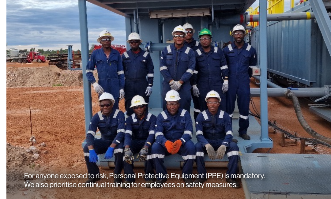
For anyone exposed to risk, Personal Protective Equipment (PPE) is mandatory. We also prioritise continual training for employees on safety measures.

Currently, as our activities are primarily focused on the initial phases of exploration our emissions profile is very low. As our activities grow, we are assessing the appropriate measures for managing our emissions profile and for reducing emissions to the extent possible.