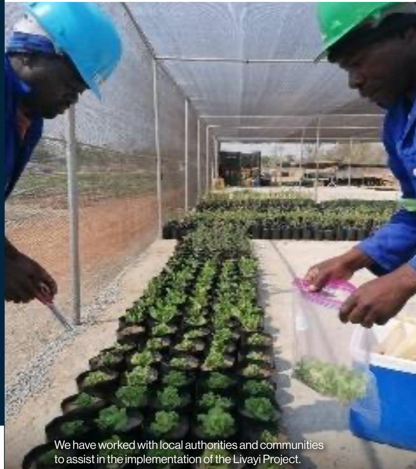
We have worked with local authorities and communities to assist in the implementation of the Livayi Project.

Reforestation is also part of our land rehabilitation plan. In line with our rehabilitation obligations, we seek input from affected communities about the types of initiatives they would like to see included in the programmes. Once adopted by the community, the plan is submitted to the appropriate regulatory authority for monitoring.