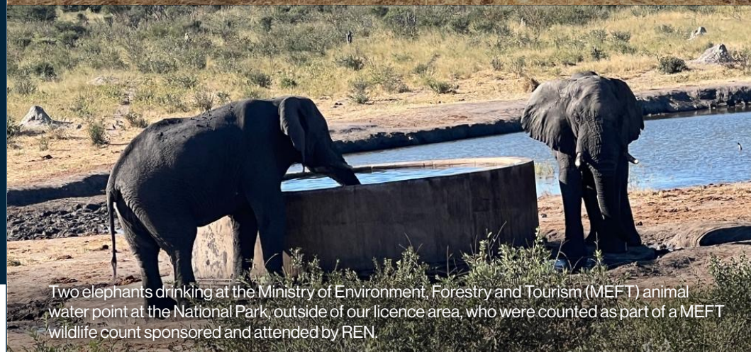
Two elephants drinking at the Ministry of Environment, Forestry and Tourism (MEFT) animal water point at the National Park, outside of our licence area, who were counted as part of a MEFT wildlife count sponsored and attended by REN.