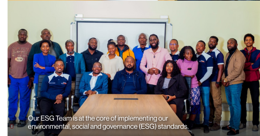
Our ESG Team is at the core of implementing our environmental, social and governance (ESG) standards.