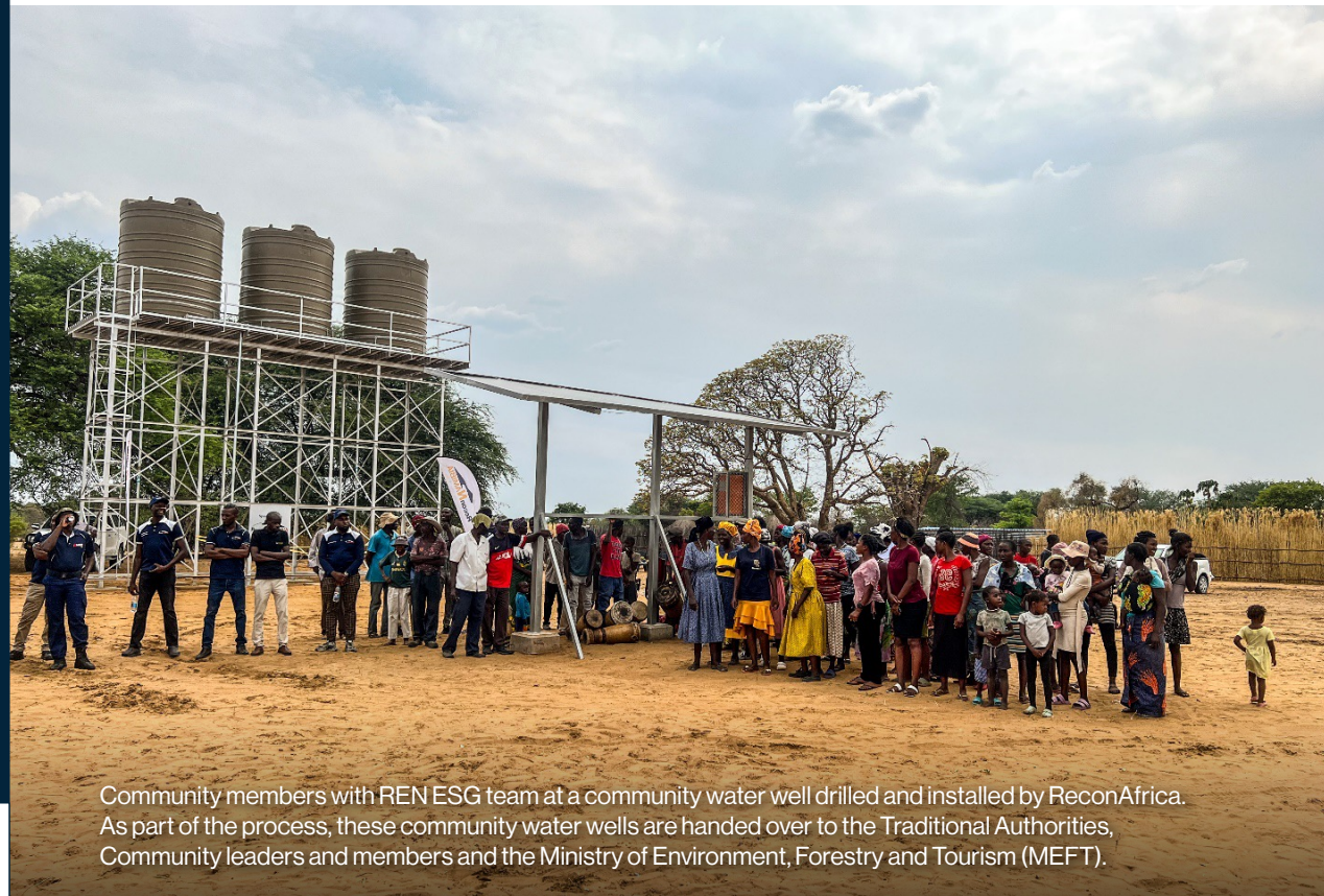
Community members with REN ESG team at a community water well drilled and installed by ReconAfrica. As part of the process, these community water wells are handed over to the Traditional Authorities, Community leaders and members and the Ministry of Environment, Forestry and Tourism (MEFT).

As part of this initiative we work directly with the Ministry of Agriculture, Water and Land Reform (MAWLR) which is responsible for placement and permitting of the water wells. To date in our licence area, we have built and handed over to MAWLR, wells that benefit over 10,000 people from the two regions. The drilling and installing of community water wells continues to be a focus in our community outreach programme.