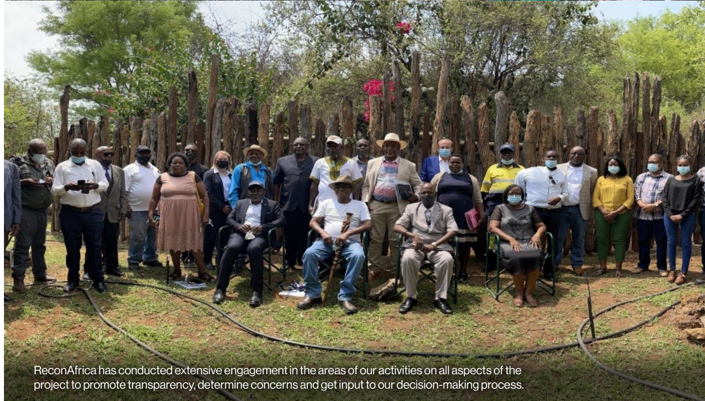
ReconAfrica has conducted extensive engagement in the areas of our activities on all aspects of the project to promote transparency, determine concerns and get input to our decision-making process.