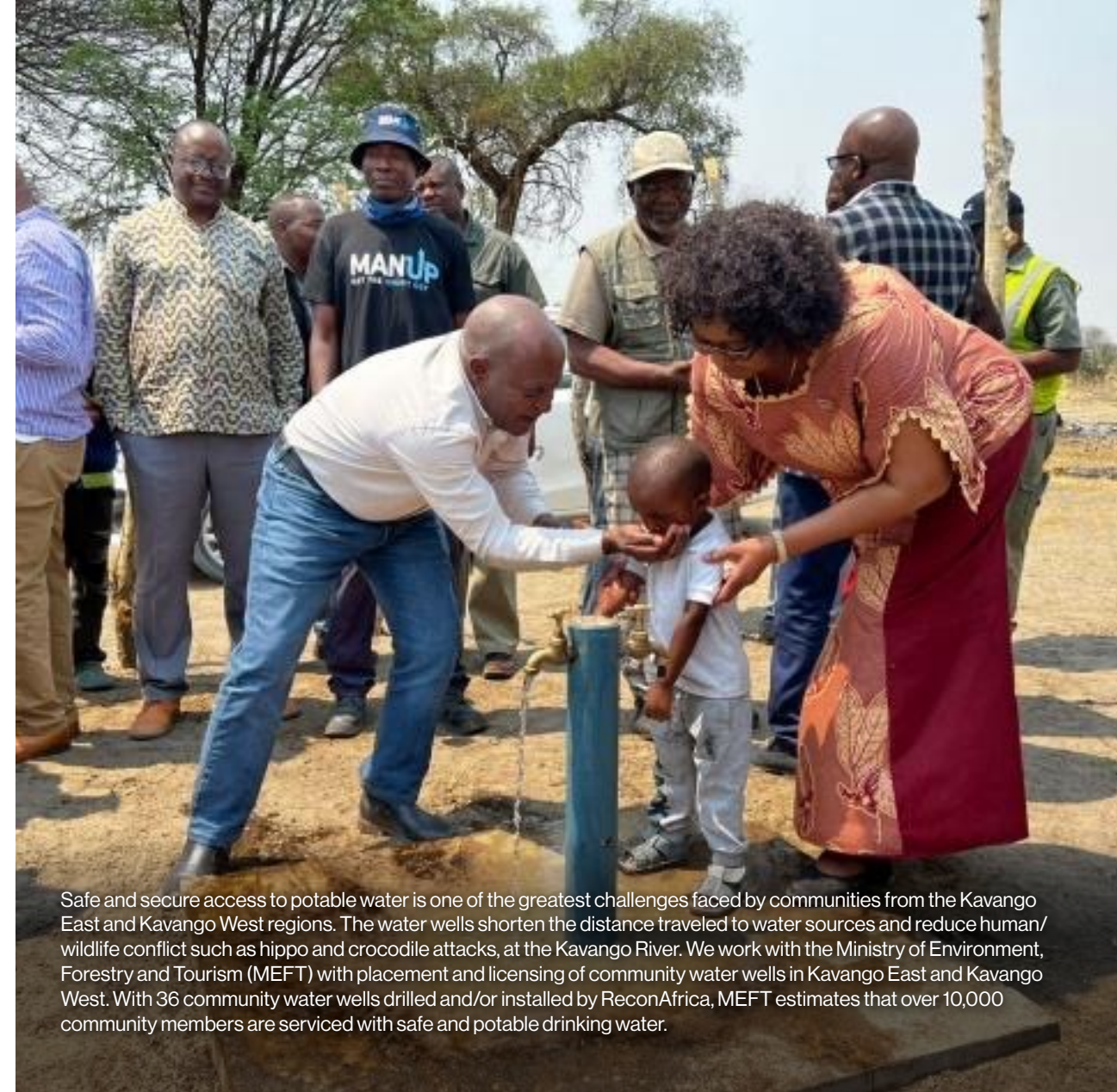
Safe and secure access to potable water is one of the greatest challenges faced by communities from the Kavango East and Kavango West regions. The water wells shorten the distance traveled to water sources and reduce human/wildlife conflict such as hippo and crocodile attacks, at the Kavango River. We work with the Ministry of Environment, Forestry and Tourism (MEFT) with placement and licensing of community water wells in Kavango East and Kavango West. With 36 community water wells drilled and/or installed by ReconAfrica, MEFT estimates that over 10,000 community members are serviced with safe and potable drinking water.

This report details these efforts and summarises our company’s progress to date.