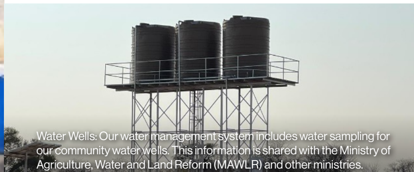
Water Wells: Our water management system includes water sampling for our community water wells. This information is shared with the Ministry of Agriculture, Water and Land Reform (MAWLR) and other ministries.

We also recognise that access to water is a challenge for many communities in the areas of our operations. ReconAfrica continues to bring safe potable water to Kavango East and Kavango West residents. Working closely with the Ministry of Agriculture, Water and Land Reform (MAWLR), we have drilled and donated solar-powered community water wells at 36 locations in our licence area to date. We have water testing programmes for these community water wells and MAWLR tracks this data and assumes responsibility for the wells when the projects are handed over to them.