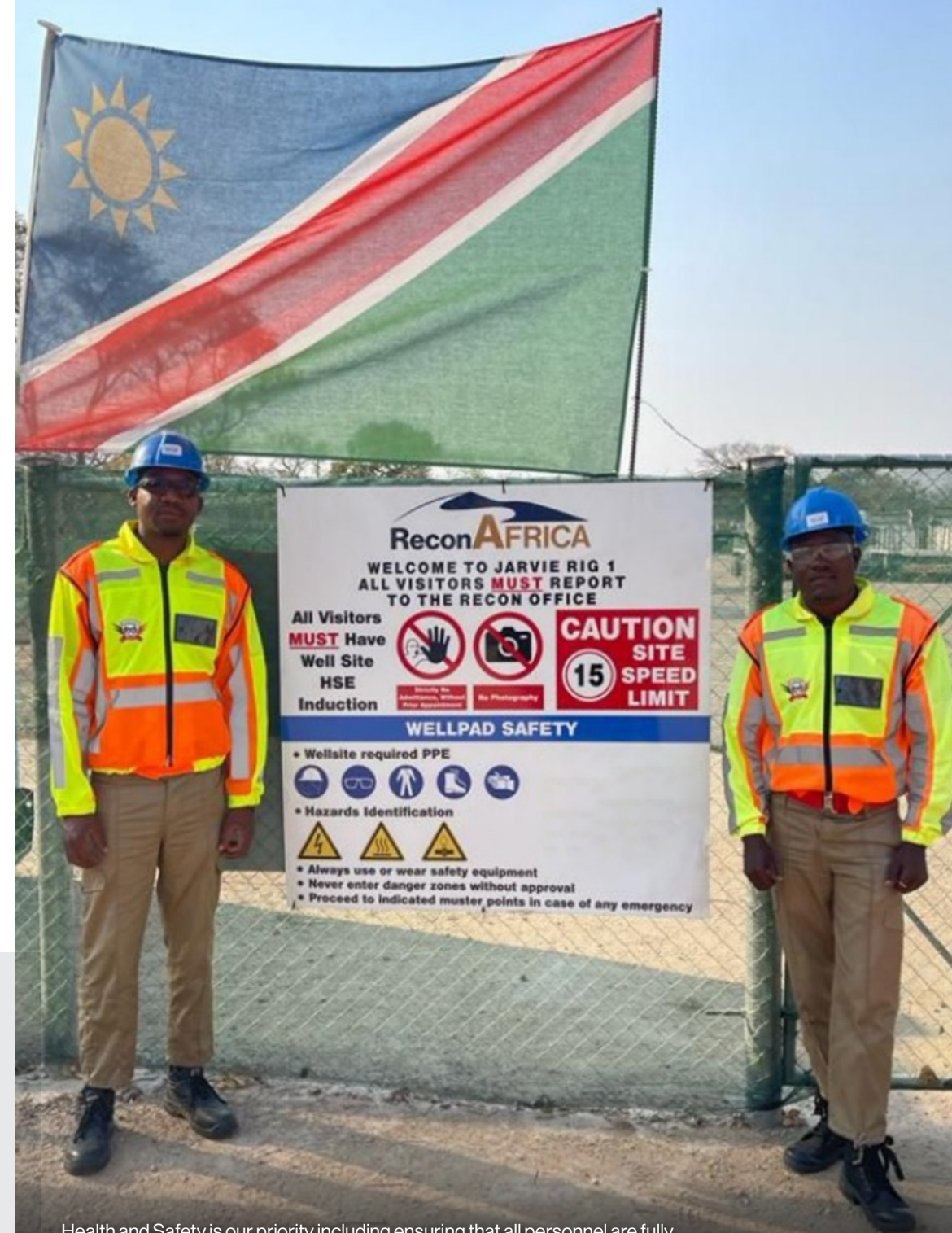
Health and Safety is our priority including ensuring that all personnel are fully aware of their responsibilities, and are accountable for EH&S performance.