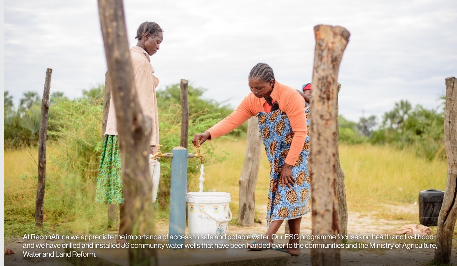
At ReconAfrica we appreciate the importance of access to safe and potable water. Our ESG programme focuses on health and livelihood and we have drilled and installed 36 community water wells that have been handed over to the communities and the Ministry of Agriculture, Water and Land Reform.

We also follow Canadian Federal Laws including the Canadian Charter of Rights and Freedoms (1982), the Canadian Human Rights Act (1977) and Provincial and Territorial Human Rights Laws.