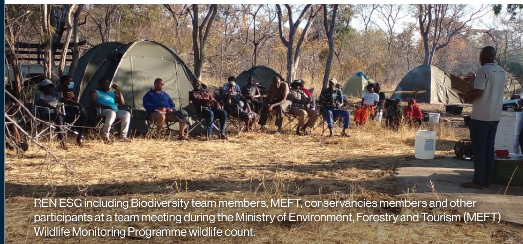
REN ESG including Biodiversity team members, MEFT, conservancies members and other participants at a team meeting during the Ministry of Environment, Forestry and Tourism (MEFT) Wildlife Monitoring Programme wildlife count.