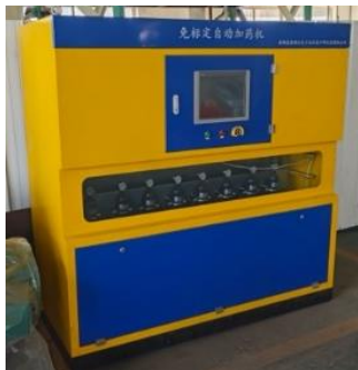
CNC REAGENT FEEDER