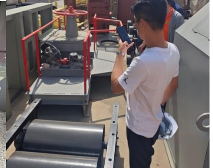
DRIVE & POSITIONING