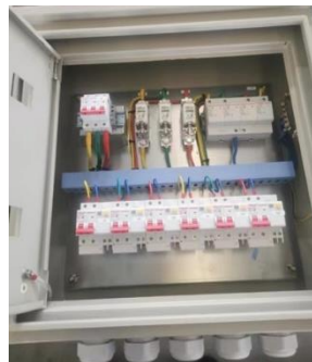
UNIT CONTROL CABINET