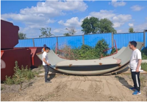
CRUSHED ORE BIN