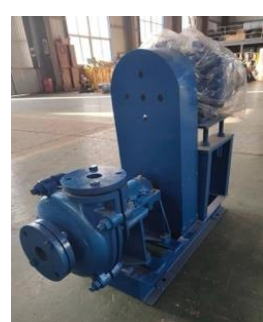
FILTER PRESS PUMP