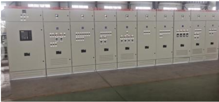
MCC CABINET CENTRE & ONE WITH DOOR OPEN