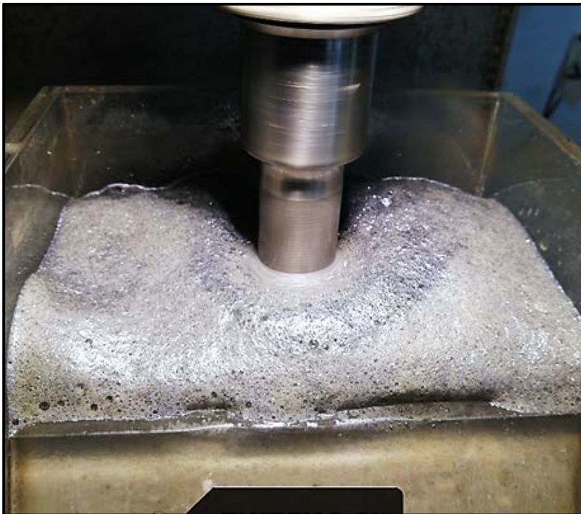
Figure 2. Rougher flotation test work from Titov, Ravenswood West.

Preliminary test work utilising cleaner flotation (optimised for molybdenum concentrate grade) lowered the mass pull to 0.6% and produced final concentrates grading up to 56.8% Mo. It is anticipated that similar test work optimised for both copper and molybdenum will improve the grade of copper concentrates.