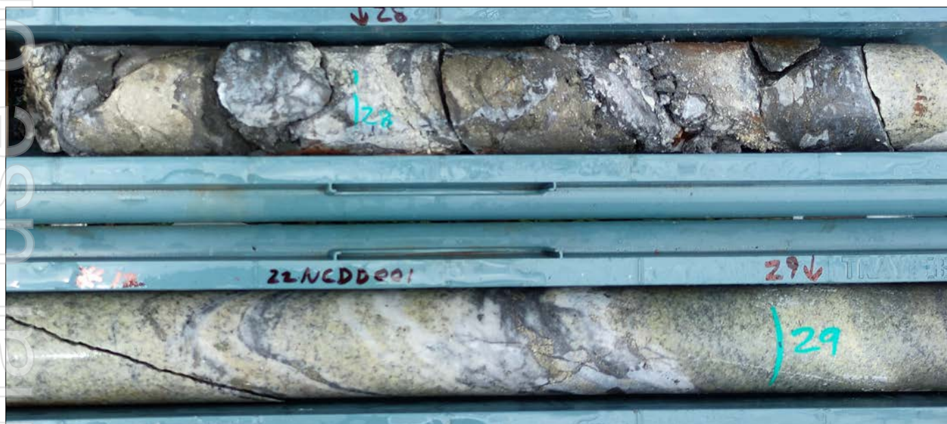
Figure 1. Sulphide-rich mineralised position in diamond hole 22NCDD001 (28m - 29m).