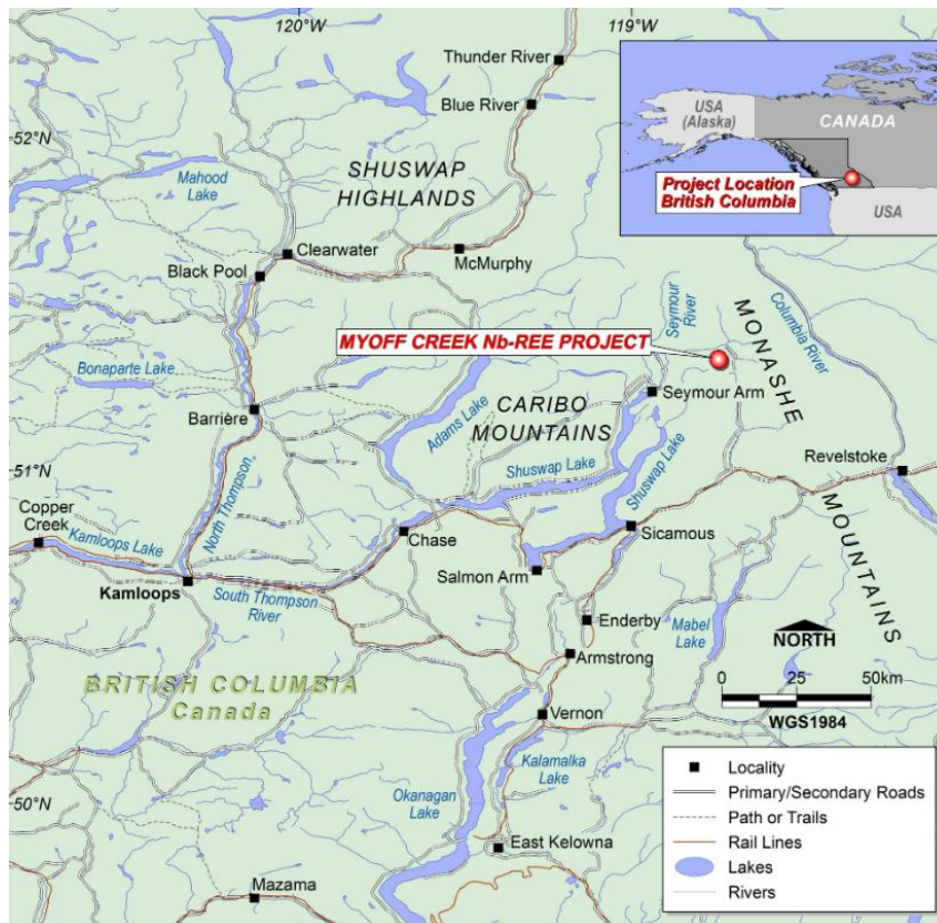
Figure 1 – Myoff Creek Project location

The Myoff Creek Nb-REE project is located in the northern Monashee Mountains of south-eastern BC, Canada.