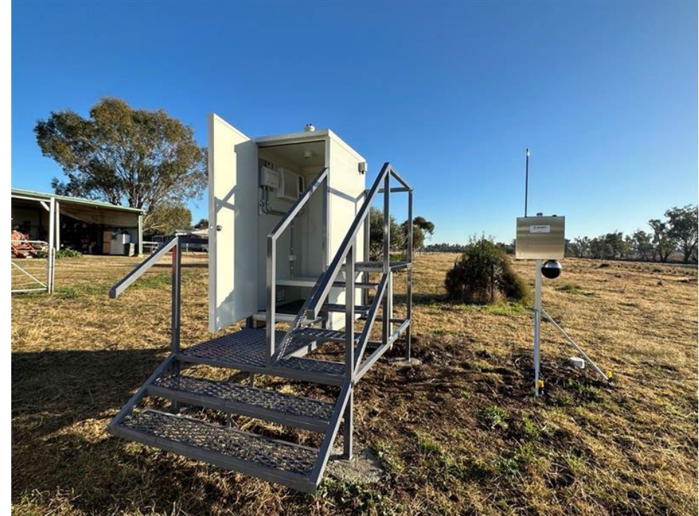
TEOM installed at ‘Lanreef’- PM1