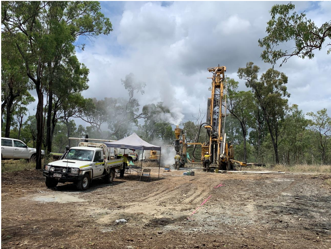
Figure 1 RC drill rig at Douglas Creek