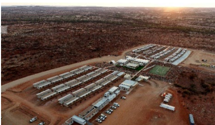
Kurrbili Accommodation Village