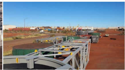
Flotation Cells & Structural Steel in WA