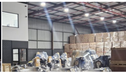
Long lead equipment in WA