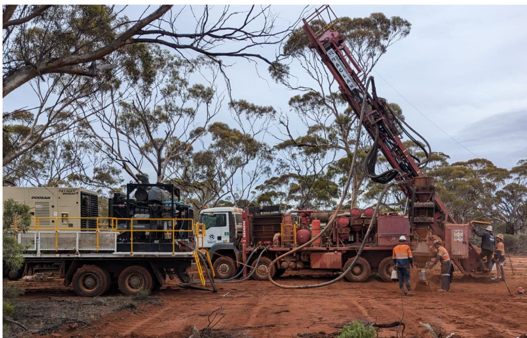
Figure 1: RC drill rig commencing the drill program at Karonie Project

Alchemy Resources Limited (ASX: ALY) (“Alchemy”) is pleased to report that RC drilling has commenced on the Company’s 100% owned Karonie Gold Project in Western Australia. Drilling comprises 12 holes at three new target areas known as Cheynes, Ezmay and Monty prospects. The targeting follows a comprehensive program of geochemical sampling and re-sampling of historic holes to expand Alchemy’s knowledge of protolith geology.