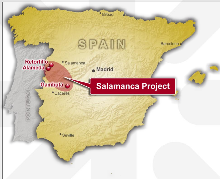
Figure 1: Location of the Salamanca Project, Spain

The Project hosts a Mineral Resource of 89.3Mlb uranium, with more than two thirds in the Measured and Indicated categories. In 2016, Berkeley published the results of a robust Definitive Feasibility Study ( DFS ) for Salamanca confirming that the Project may be one of the world's lowest cost producers, capable of generating strong after-tax cash flows.