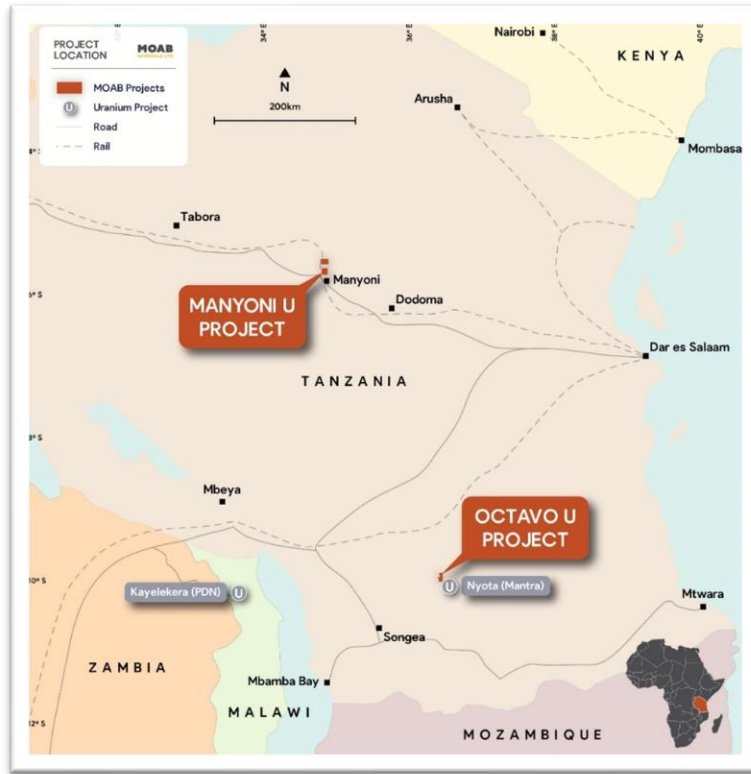
Figure 1. Location of the Manyoni Uranium Project