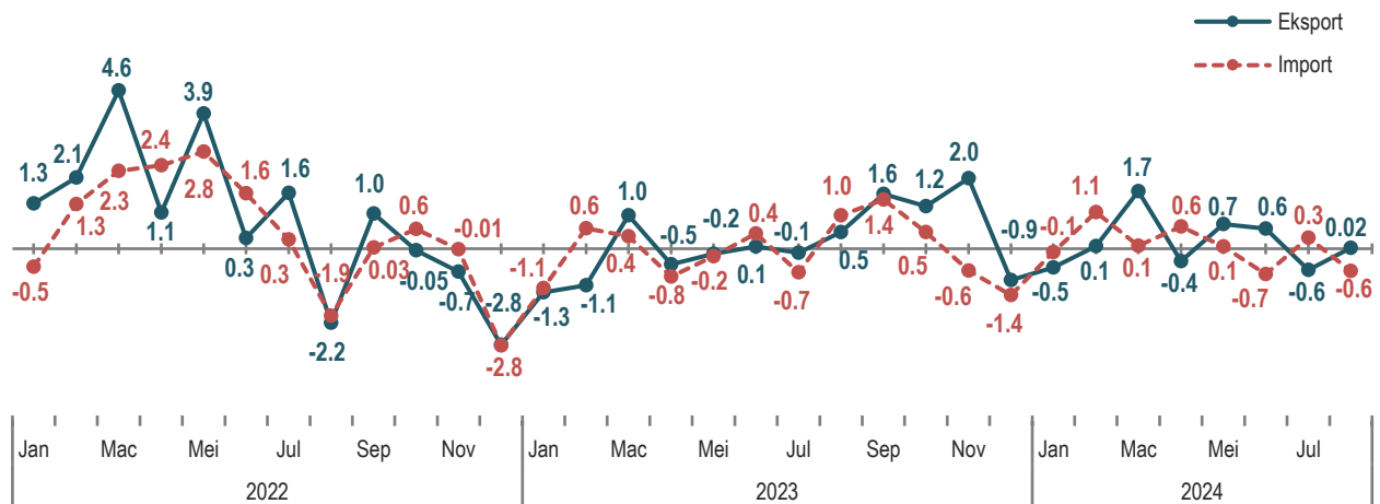
Carta 1: Peratus Perubahan Bulan ke Bulan bagi Indeks Nilai Seunit Eksport & Import Januari 2022 – Ogos 2024