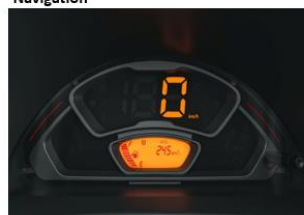
Digital Speedometer Display