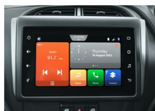
SmartPlay Studio with Smartphone Navigation