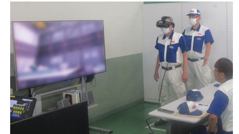
VR safety training at the safety dojo

The NSK Group has established facilities called "Safety Dojo" at all production sites, where employees receive training using simulators to experience potential workplace hazards. In these dojos , employees learn the importance of prioritizing safety by recognizing the risks of hazardous tasks by learning from actual workplace incidents that have occurred within the NSK Group, while being trained to follow correct operating procedures. All plant employees receive regular, annual training at the Safety Dojo. VR (virtual reality) content has also been incorporated into the curriculum, allowing participants to simulate experiences such as working at heights and dealing with fire hazards.