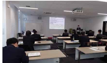
In-house training to improve the risk assessment skills of certified personnel

As of the end of FY2022, NSK had a total of 991 safety assessors (245 in engineering,