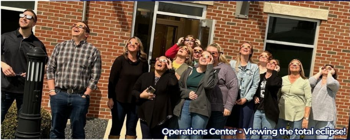
Operations Center - Viewing the total eclipse!