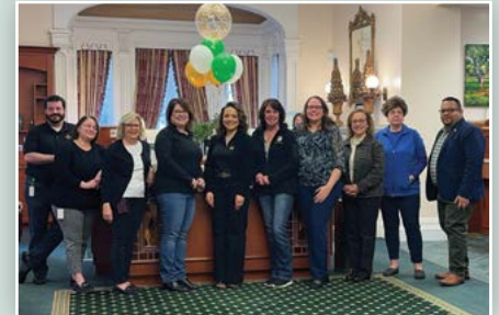
The Andover team at the Branch's 20th Anniversary celebration.

Our Acton branch recognized its 15th anniversary on January 12, and our Andover Branch celebrated its 20th anniversary on March 15. The teams at each location created a festive atmosphere and greeted customers and visiting members of the Enterprise Bank family throughout the day. Refreshments were served and photos were shared on social media to mark the festivities and invite customer engagement.