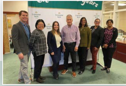
The Acton team celebrated the branch's 15th anniversary in January.