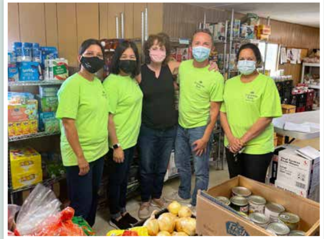
Enterprise Bank team members have a passion for volunteering to help our communities.

We are proud of our Enterprise Team, and we are extremely grateful for all they do every day in the communities where we work and live. 2020 was a year like no other and our commitment to our communities never wavered.