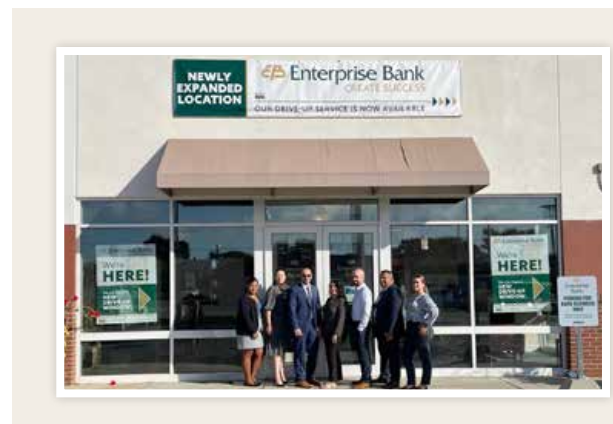
The Lawrence team began welcoming customers to their new end-unit location on August 30, 2021. The space offers drive-up teller and ATM service.

On August 30, the Lawrence branch opened for service in our new end unit space at 290 Merrimack Street, next door to our previous location. Customers and community leaders visited during the day for tours of the space and to enjoy refreshments. Perhaps the biggest highlight of the new space is the drive-up service lane, a much-needed service element for one of our busiest branches.