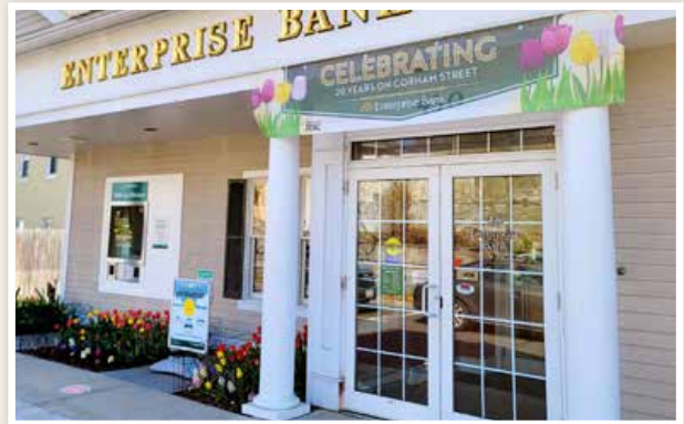
The Lowell Connector branch at 430 Gorham Street.