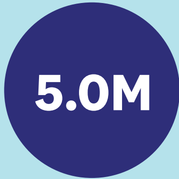
TOTAL END OF PERIOD SUBSCRIBERS