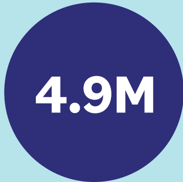
TOTAL END OF PERIOD SUBSCRIBERS