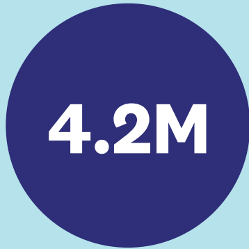
TOTAL END OF PERIOD SUBSCRIBERS