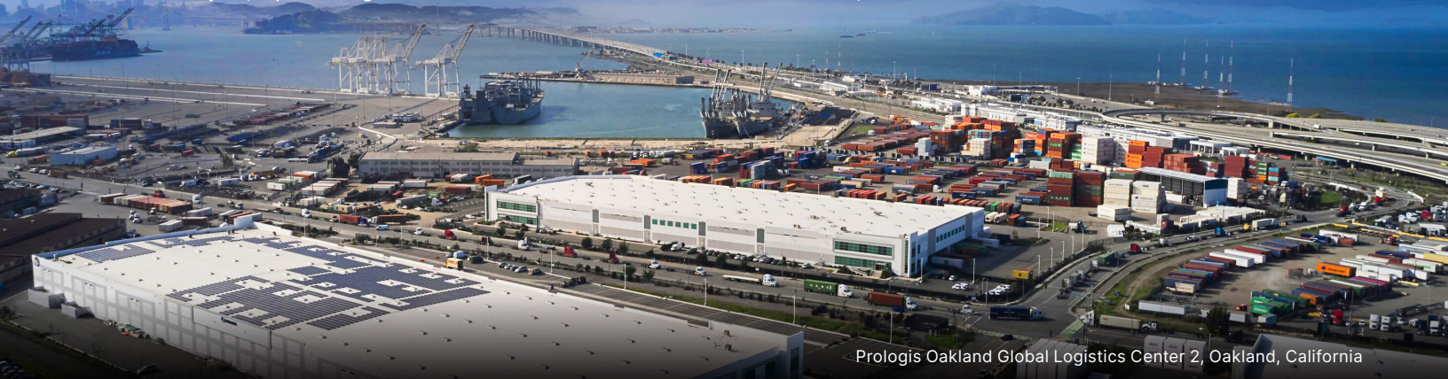
Prologis Oakland Global Logistics Center 2, Oakland, California