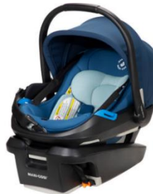
Maxi-Cosi Coral XP