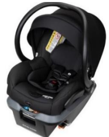
Maxi-Cosi Mico XP