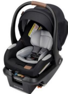
Maxi-Cosi Mico Luxe+