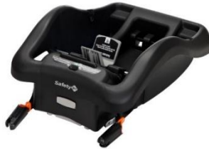
Safety 1 st SecureTech Infant Base