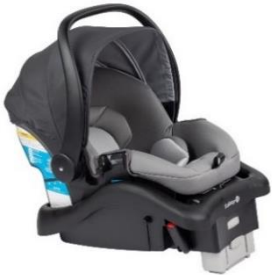
Safety 1 st onBoard 35 SecureTech

When these car seats are installed into the vehicle with the base secured using the lower anchors, they may detach which will not adequately protect the child from injury in the event of a crash. Also, installing Coral XP into a vehicle with only its inner carrier is not sufficient to restrain a child without the use of the outer carrier.