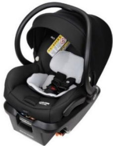
Maxi-Cosi Mico XP Max