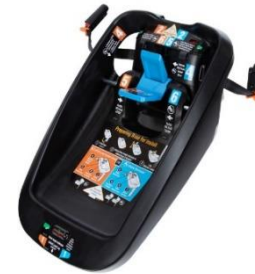
Maxi-Cosi Infant Base

The following models, from all dates of manufacture, are included in this recall: IC313FNA, IC313FNB, IC313FNC, IC313FND, IC313GHT, IC335BLK, IC336FYH, IC336FZA, IC336FNA, IC336FZH, IC336FZJ, IC336FZL, IC336FZO, IC336GCA, IC336GCB, IC337FNA, IC337FNB, IC337FZF, IC337FZG, IC337FZH, IC337GKE, IC337GKF, IC338FNA, IC338FNB, IC351GKN, IC351GKO, IC351GKP, IC351GKQ, IC351HAS, IC351HAY, IC370FNA, IC370FNG, IC370GKE, IC370GKF, IC372BLK