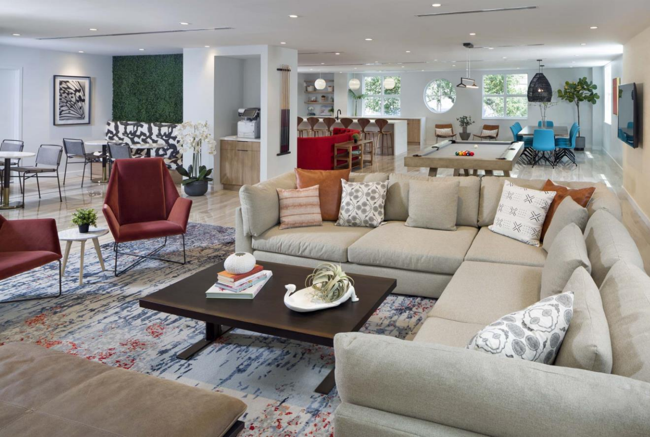
Camden Brickell Miami, FL