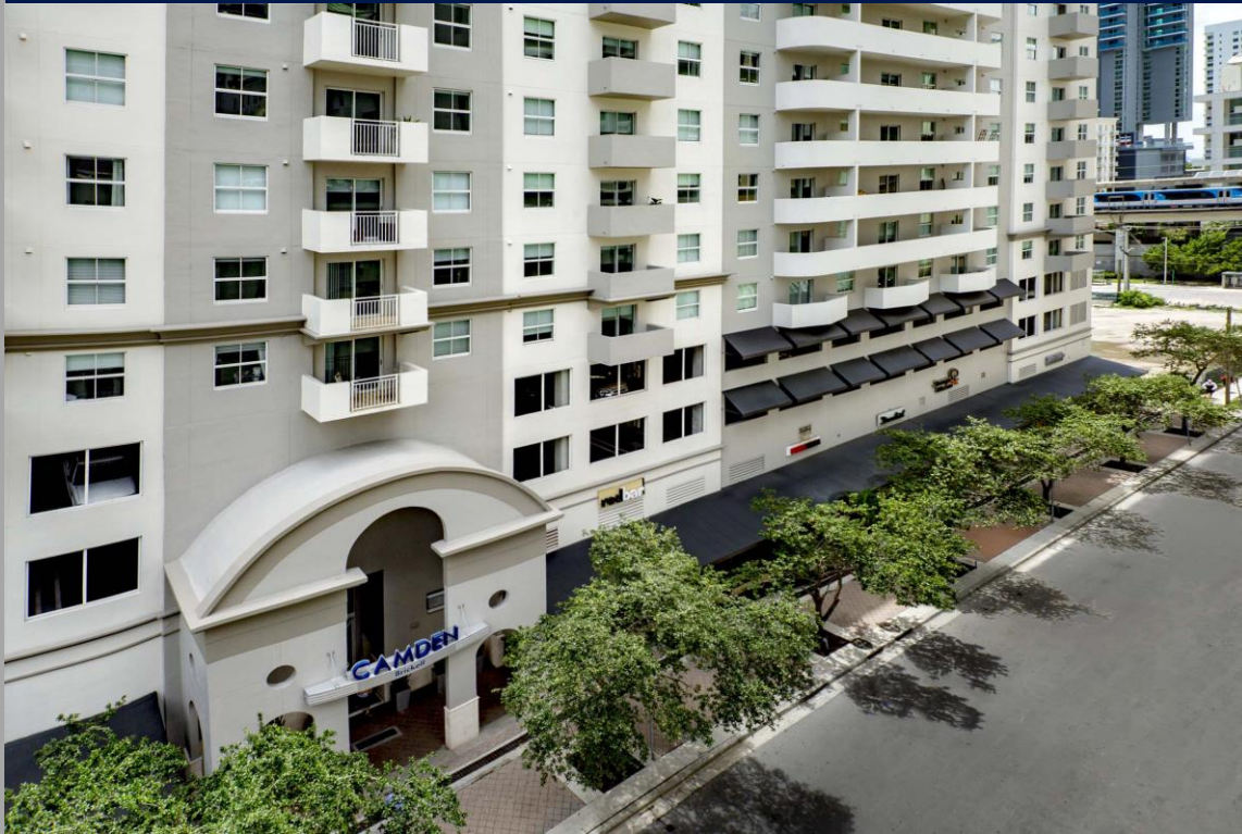
Camden Brickell Miami, FL