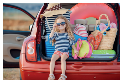
Solutions for Polymers

In addition, Borcycle M and the ISCC PLUS-certified Borcycle C compounds based on mechanically and chemically recycled feedstock as well as the ISCC PLUS-certified Bornewables compounds using renewable-based feedstock meet a growing demand for high-sustainability building and infrastructure pipe polymers.