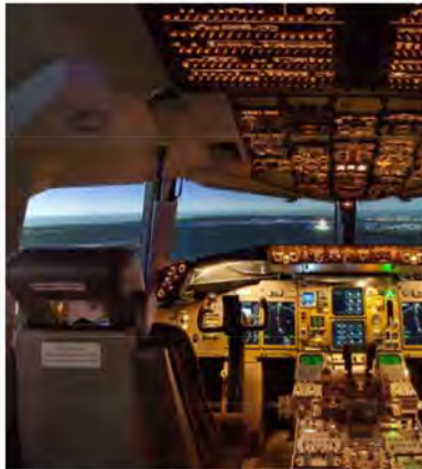
Air Transport Simulation

Boeing | Iceland Air | Delta | UPS | Korean Air | Civil Aviation Flight University of China | Pacific Sky | Copa Airlines | Citation Jet Pilots | Wheels Up Pilots | Oman Air | Transport China