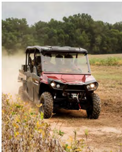
Textron Specialized Vehicles $1.1B