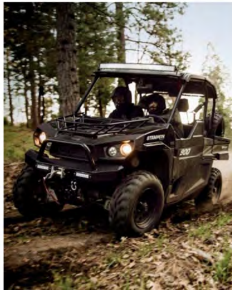
Textron Off Road Stampede 4x4