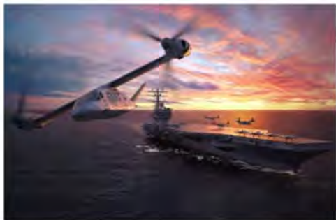
Bell V-280 Valor