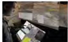
Command & Control Technologies