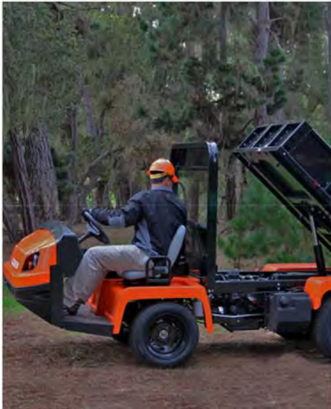
Jacobsen Truckster XD

Driving Growth by Investing in New Products