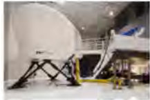
TRU Simulation + Training