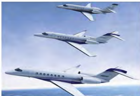
Cessna Citation Latitude, Longitude & Hemisphere