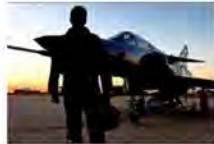
Textron Airborne Solutions