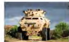
Tactical Wheeled Vehicles