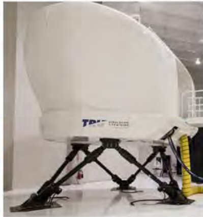
Commercial & Military Simulation