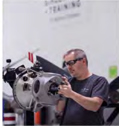
Mission & Maintenance Training