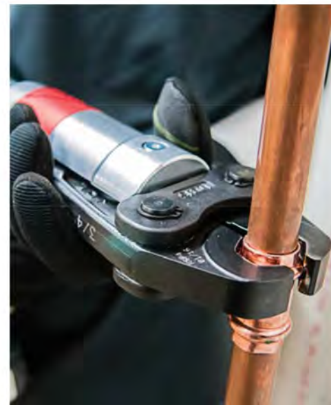
Textron Tools & Test $0.4B