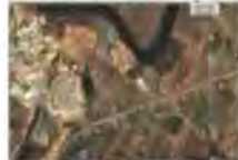
Geospatial Solutions & Advanced Information Solutions