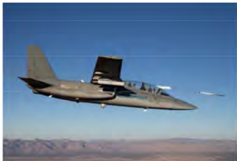
Scorpion Hybrid ISR/Strike Aircraft