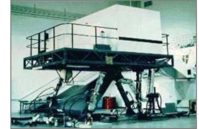
B-1B Weapon System Trainer