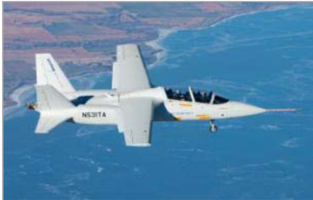
Scorpion Hybrid ISR/Strike Aircraft