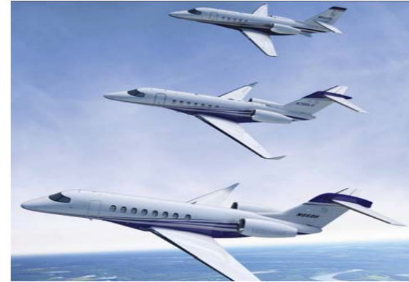
Cessna Citation Latitude, Longitude & Hemisphere