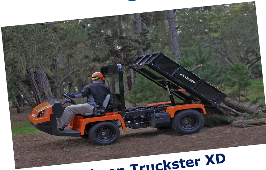
Jacobsen Truckster XD