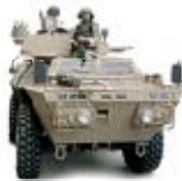
Tactical Wheeled Vehicles