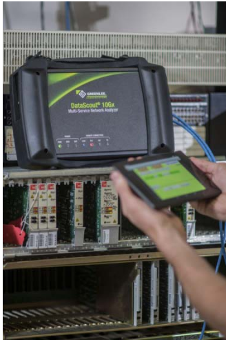
Tools & Test $445 million