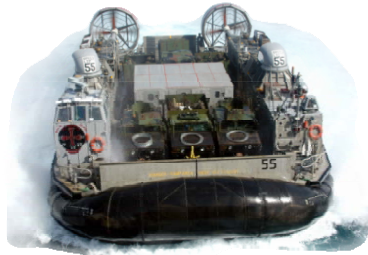
Navy Ship-to-Shore Connector