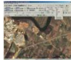
Geospatial Solutions & Advanced Information Solutions