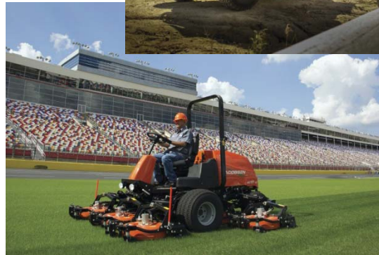
Specialized Vehicles & Jacobsen $1,021 million