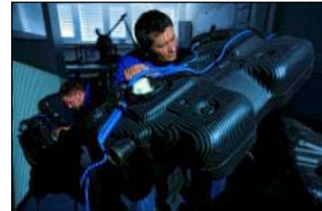
Kautex $2,078 million

Focused on new products, cost productivity and geographic expansion