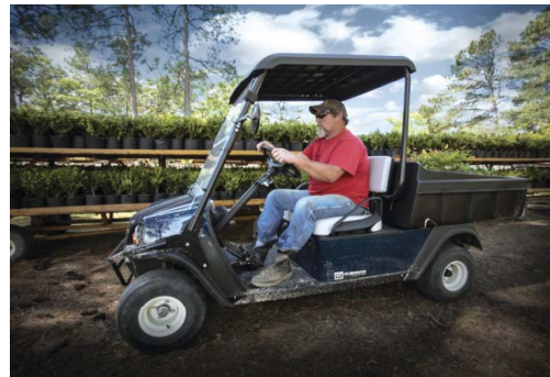
Cushman Hauler PRO

New products drive growth and profitability