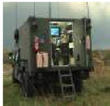
Command & Control Technologies