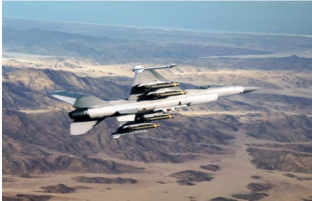
Sensor Fuzed Weapon (SFW)