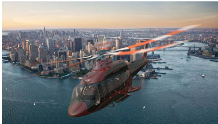
Bell 525 Relentless