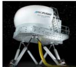
TRU Simulation + Training