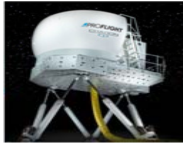
CJ3 Flight Simulator