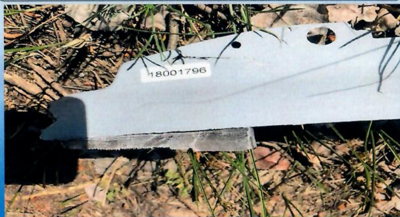
Identification by serial number