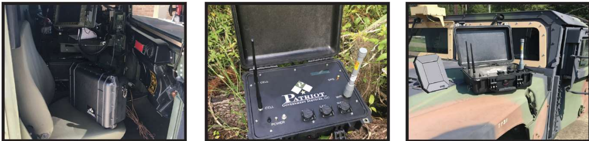
SENTINEL—FULL FEATURED PROTOTYPE

The SENTINEL technology developed and marketed by a management team focused on becoming the leader in emergency communications and operation support services. With over two decades of combined experience in wireless communications, integration of voice, video, data technologies, and emergency/disaster response program management, our management is positioned to solve technical problems with world-class solutions.