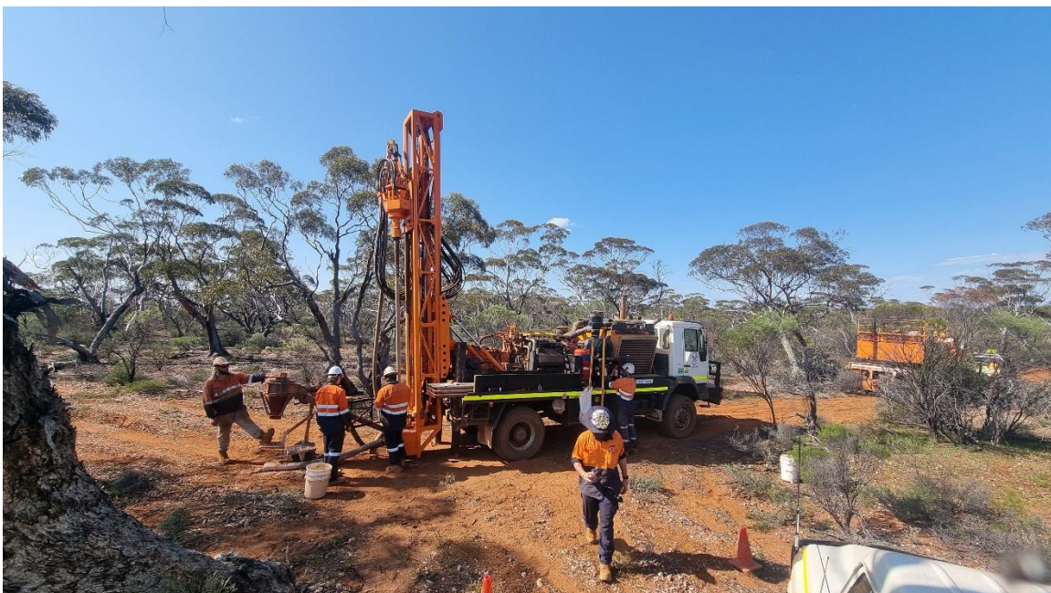
Figure 1 Aircore drill rig at Mt Jackson

The drilling is expected to take three weeks to complete with results to follow in Q4 2024.