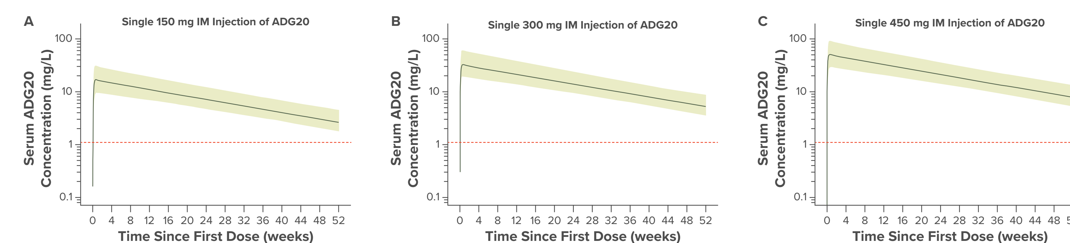
Figure 4. Optimized QSP model-predicted median (90% PI) serum ADG20 PK profiles following a single IM 150 mg (A), 300 mg (B), and 450 mg (C) injection in humans

Dashed red line represents 100 \times in vitro IC_{90} of 0.011 µg/mL or 1.1 mg/L against the USA-WA1 strain.