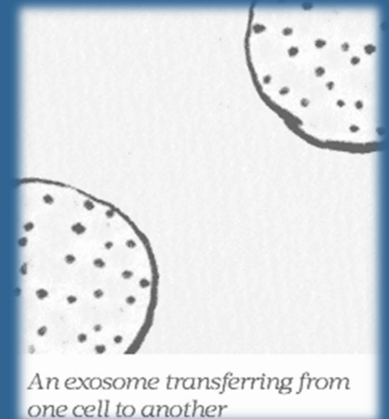
An exosome transferring from one cell to another