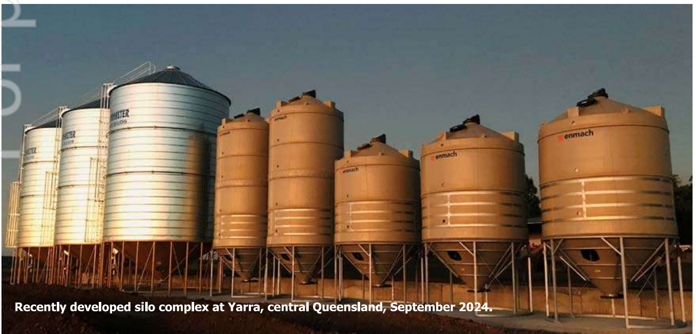
Recently developed silo complex at Yarra, central Queensland, September 2024.

The Responsible Entity's approach to managing material exposures is outlined in the RFF Annual Report 2024 . Management of environmental (including climate-related impacts) and social risks are incorporated in the entity's risk management framework. The Board is responsible for overseeing the risk management framework, with the internal management of the framework delegated to the ICC.