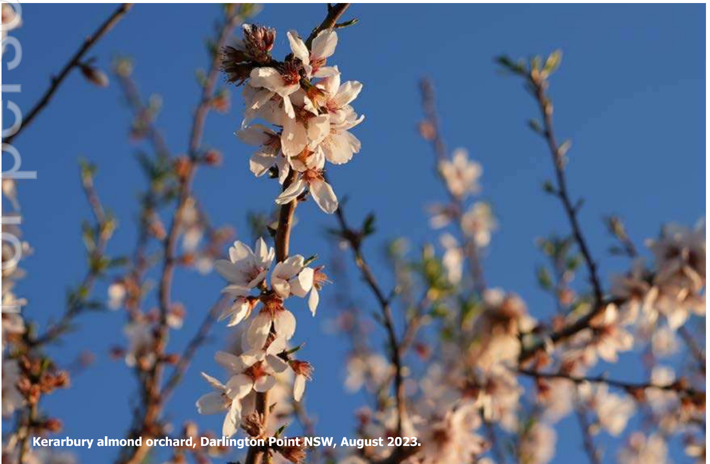
Kerarbury almond orchard, Darlington Point NSW, August 2023.

Boardroom, the Fund's registry service provider, provides the option for Unitholders to receive their communications electronically. The Responsible Entity encourages all investors to communicate electronically and provides regular correspondence advising shareholders of this option.