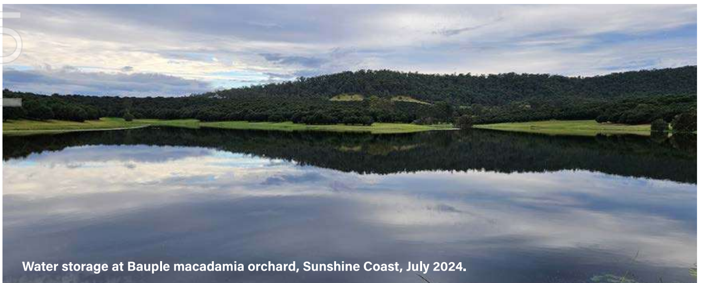
Water storage at Bauple macadamia orchard, Sunshine Coast, July 2024.

New Directors are selected and appointed in accordance with the Corporate Governance Charter. New Directors are provided with an induction relevant to the Responsible Entity and the Fund and are provided opportunities to extend their skills and knowledge, through informal and formal means.