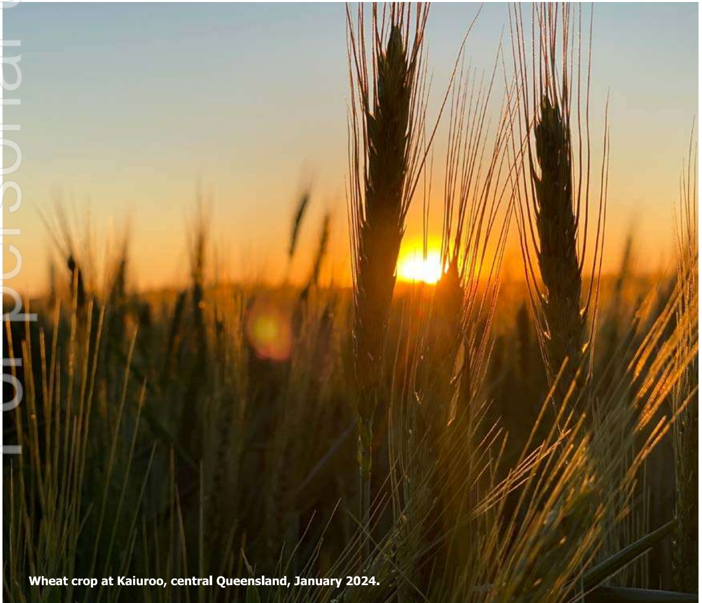
Wheat crop at Kaiuroo, central Queensland, January 2024.

All announcements released in respect of the Fund can be viewed at www.asx.com.au .