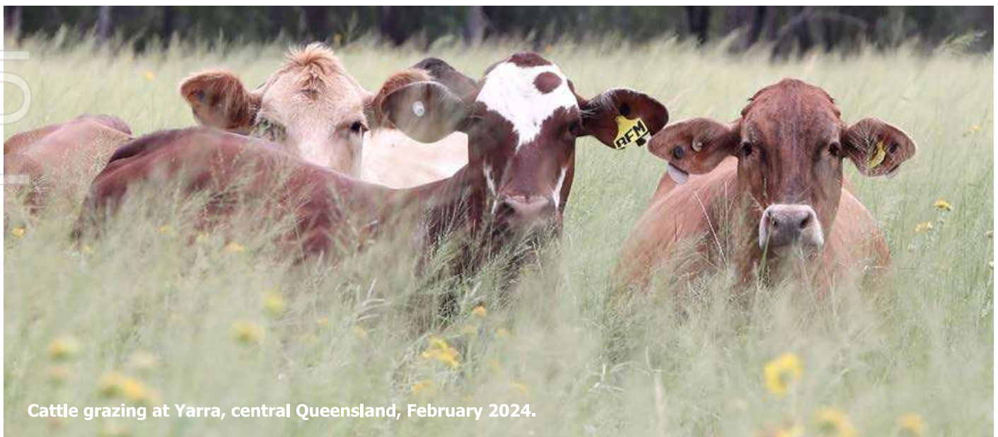
Cattle grazing at Yarra, central Queensland, February 2024.

The Audit Committee Charter is included in the Corporate Governance Charter, is available on the Responsible Entity's website.