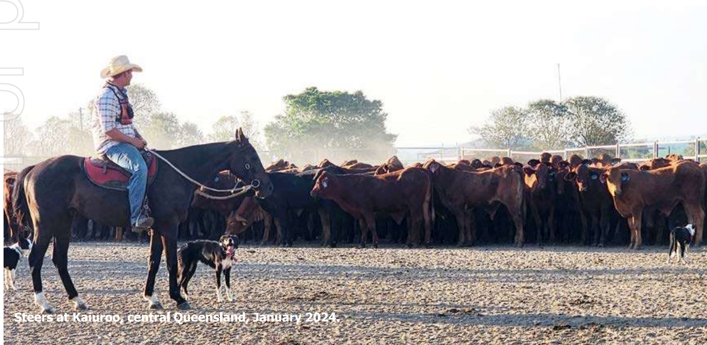
Steers at Kaiuroo, central Queensland, January 2024.

As an externally managed scheme, recommendations 9.1, 9.2 and 9.3 do not apply to the Fund.