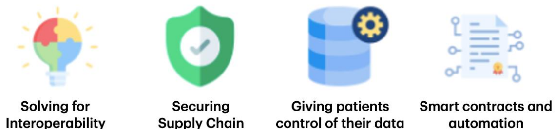
Figure 1 : Blockchain's main contributions to healthcare

Discussions with dorsaVi's major US enterprise clients underscore the increasing demand for robust data security. By evaluating blockchain's potential, dorsaVi aims to align its data platform with these priorities, ensuring it can continue to deliver value to enterprise customers while unlocking new commercial opportunities.