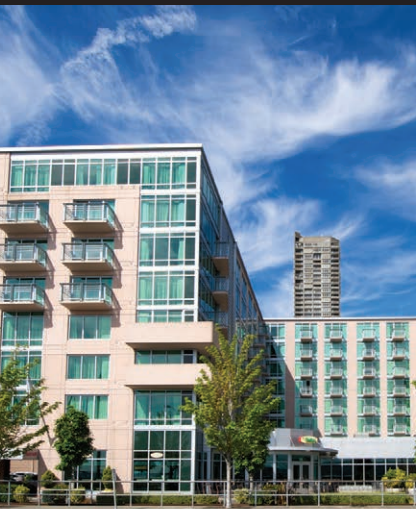
Marriott Seattle Seattle, WA