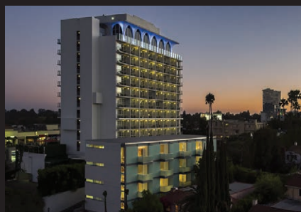
Cameo Beverly Hills Beverly Hills, CA