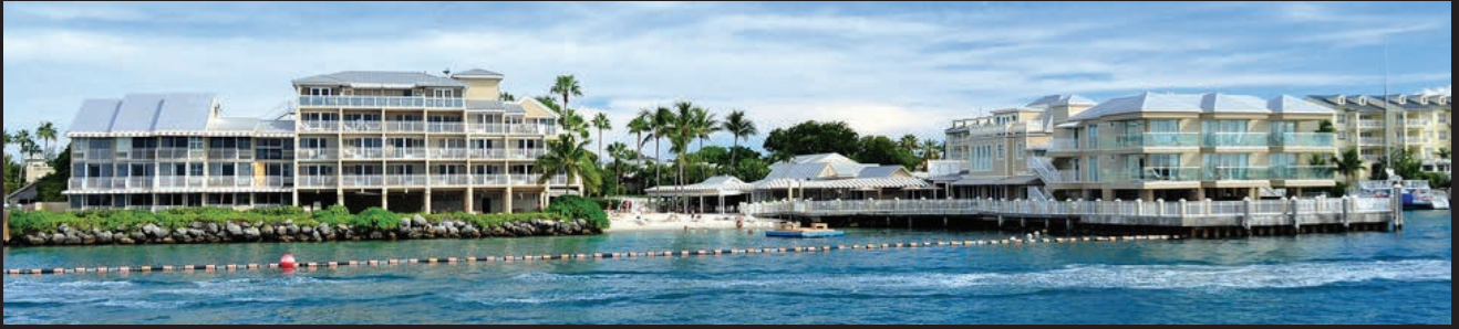
Pier House Resort Key West, FL