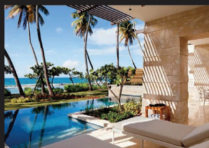
The Ritz-Carlton Reserve Dorado Beach Dorado, Puerto Rico