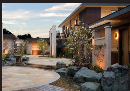
Bardessono Hotel and Spa Yountville, CA