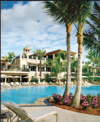
The Ritz-Carlton Sarasota Sarasota, FL