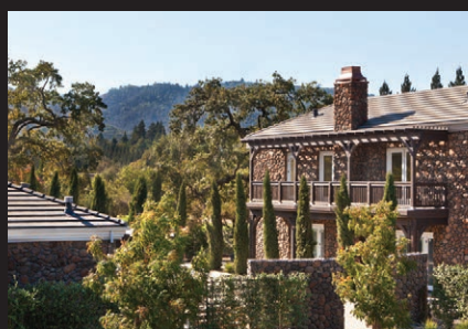
Hotel Yountville Yountville, CA