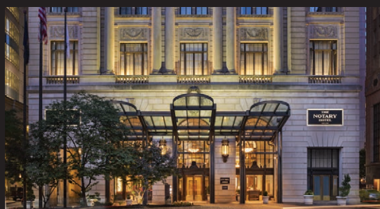
The Notary Hotel Philadelphia, PA