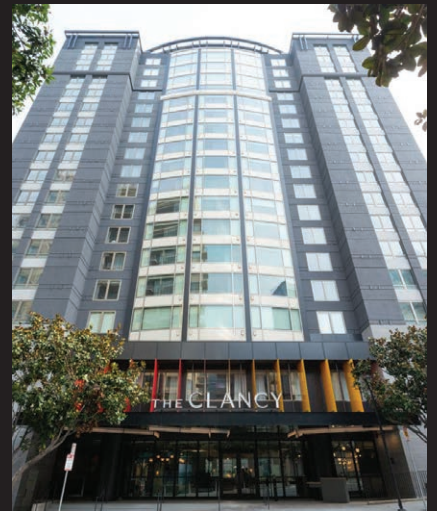
The Clancy San Francisco, CA