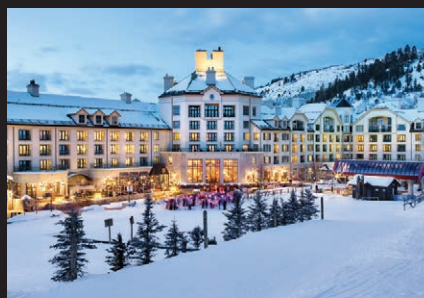
Park Hyatt Beaver Creek Beaver Creek, CO