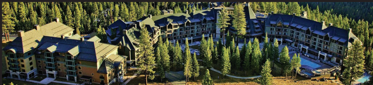
The Ritz-Carlton Lake Tahoe Truckee, CA