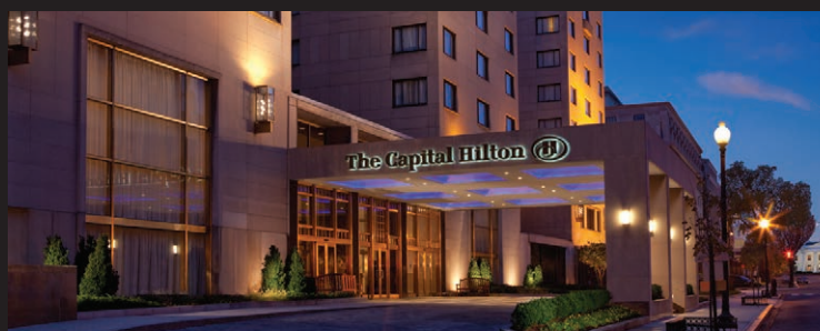
The Capital Hilton Washington, DC