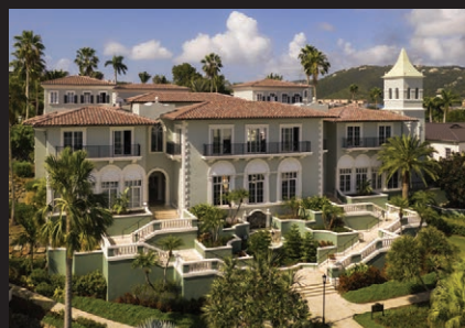
The Ritz-Carlton St. Thomas St. Thomas, USVI