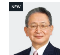
Outside Audit & Supervisory Board Member

4/1976 Appointed as Prosecutor 7/2009 Took office as Vice-Minister of Justice 7/2012 Took office as Superintending Prosecutor of Tokyo High Public Prosecutors Office 7/2014 Took office as Prosecutor-General of Supreme Public Prosecutors Office 9/2016 Retired from the position of Prosecutor-General of Supreme Public Prosecutors Office 11/2016 Attorney at law, Special Counsel of Mori Hamada & Matsumoto (current) 6/2017 Took office as Audit & Supervisory Board Member of the Company (current)