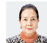
Outside Audit & Supervisory Board Member

4/1984 Joined the Company 6/2021 Took office as Standing Audit & Supervisory Board Member (current)