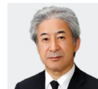
Director and Senior Executive Officer