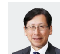
Standing Audit & Supervisory Board Member

4/1983 Joined the Company 6/2020 Took office as Standing Audit & Supervisory Board Member (current)