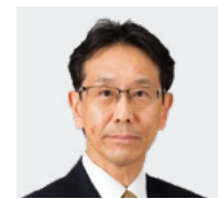
President and CEO Representative Director

4/1982 Joined the Ministry of Foreign Affairs (hereinafter "MOFA") 7/2014 Took office as Director-General, Economic Affairs Bureau and Councillor, Cabinet Secretariat 10/2015 Took office as Director-General, International Legal Affairs Bureau 7/2017 Took office as Director-General, Foreign Service Training Institute, MOFA 1/2019 Retired from MOFA 4/2020 Took office as Visiting Professor, Graduate School of Public Policy, The University of Tokyo 6/2021 Took office as Director of the Company (current)