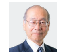
Outside Audit & Supervisory Board Member

4/1993 Took office as Professor at Ochanomizu University 4/2008 Took office as Professor Emeritus at Ochanomizu University (current) 6/2015 Took office as Audit & Supervisory Board Member of the Company (current)