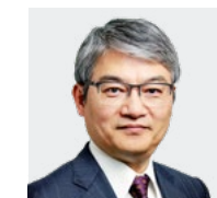
Standing Audit & Supervisory Board Member