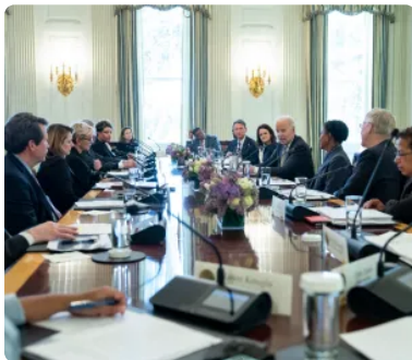
PROGRESS & UPDATES