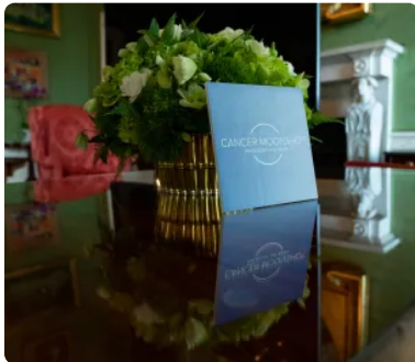
WHAT IS THE MOONSHOT?