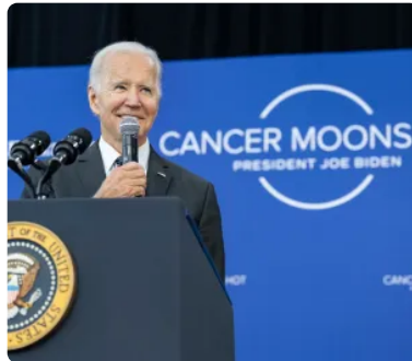
YOUR STORIES & ACTIONS